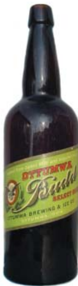
Labeled only blob beer from the Ottumwa Brewing & Ice Co.

Busch are just a few examples of major breweries that sold beer through smaller agents in Iowa.