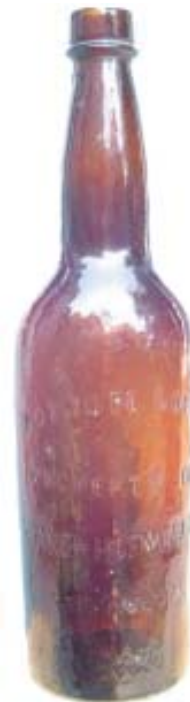
Early 1880s double collar beer - Kraner - Hoffman, Ottumwa, Iowa.

that used this style of bottle in Iowa but until further examples from other breweries turn up, Iowa collectors can only wait.