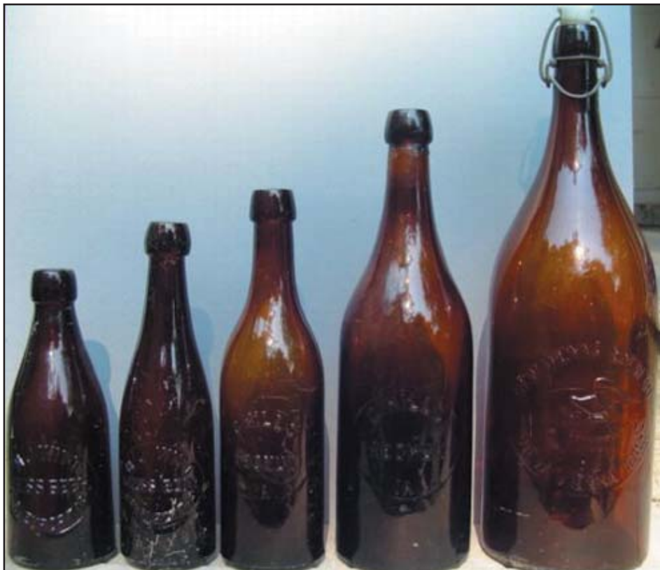
The five sizes of amber blob beers from Iowa beginning with the Pony beer on the left to the picnic beer on the right.

By the late 1890s, several breweries began to use the newer style crown top cap closure and by 1905 most all Iowa breweries had switched to using the crown top closure on their regular size bottles. Two firms in Burlington used a different style closure commonly referred to as a trim lip closure (illustrated below).