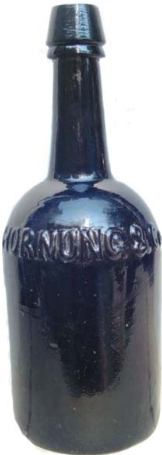
1850s black glass ale Hornung & Co., Dubuque.