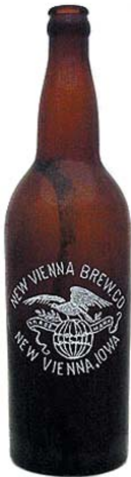
Quart beer from The New Vienna Brewing Co., New Vienna, Iowa