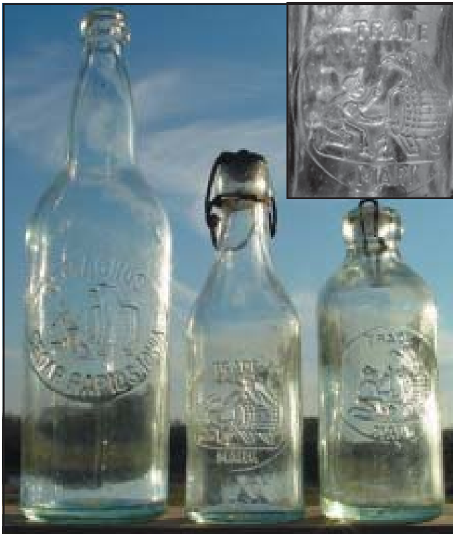
Trio of Magnus bottles from Cedar Rapids with closeup of the Magnus trademark in the inset.