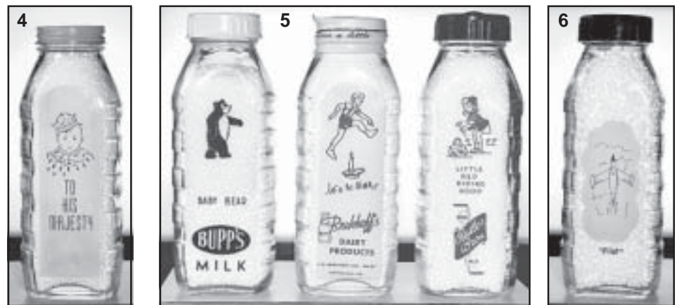
Figure 4: One of the Bank Bottles. This one is printed in blue on a white panel for the boy child. The girl version was a queen girl printed in red on a white panel. Both styles are also found without the white panel. The blue slotted top for the boy and the pink slotted top for girls were held tight by a band of heat shrink tape.