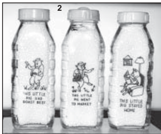
Figure 2: The Three Little Pigs set of the wide mouthed Nursery Rhyme bottles. The most common color of the pyroglazing is dark green, but they have also been seen in orange, yellow and black. These examples have the Evenflo plastic collars, not the Callet collars, mounted on the bottles. If you look carefully, you can also see the different sizes of lettering and that on the first bottle the design is slightly cockeyed.