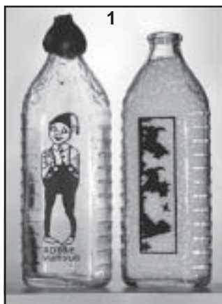
Figure 1: Two of the original Knox Glass Company set of Nursery Rhyme Baby Bottles. Note the small neck for the pull-on nipples, the line-ribbed sides and the icicle type design on the shoulder area. The Scotty Dog design (right) was not carried into the Callet set of Nursing Rhyme bottles.