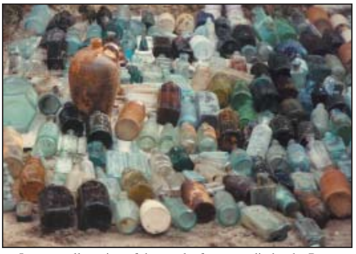
Just a small portion of the results from one dig by the Ryan Excavators.