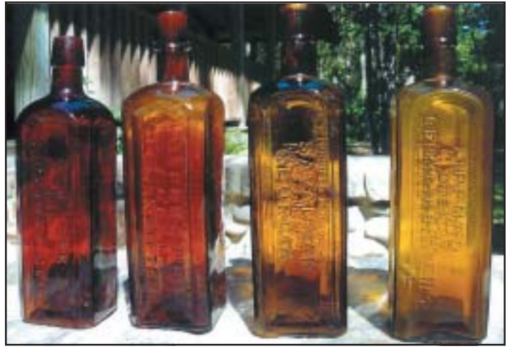
Reddish amber to honey amber marks Lippman's Great German Bitters quartet.