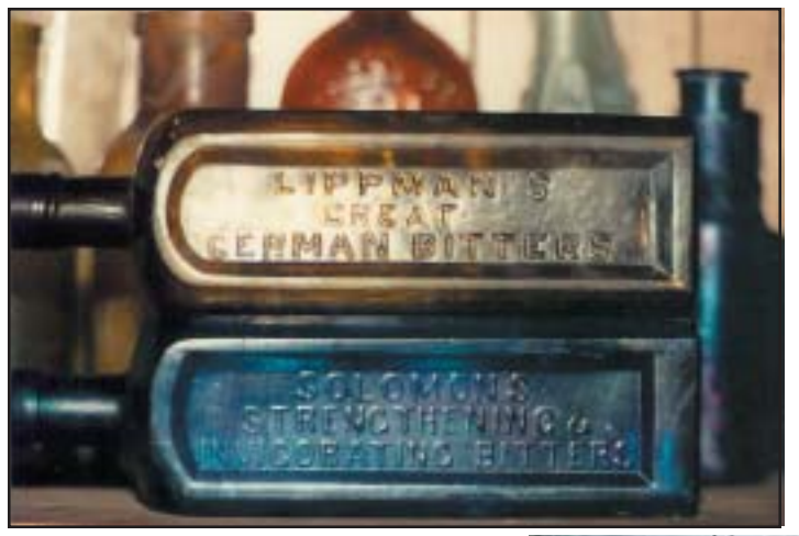
Lippman's (top) and Solomon's are Savannah's famous bitters.