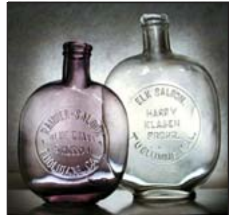
[Fig 9] Pioneer Saloon and Rainier Saloon pumpkinseed flasks from Tuolumne, CA

A few of the olympia-style flasks exist with none south of the Bay Area, to my knowledge.