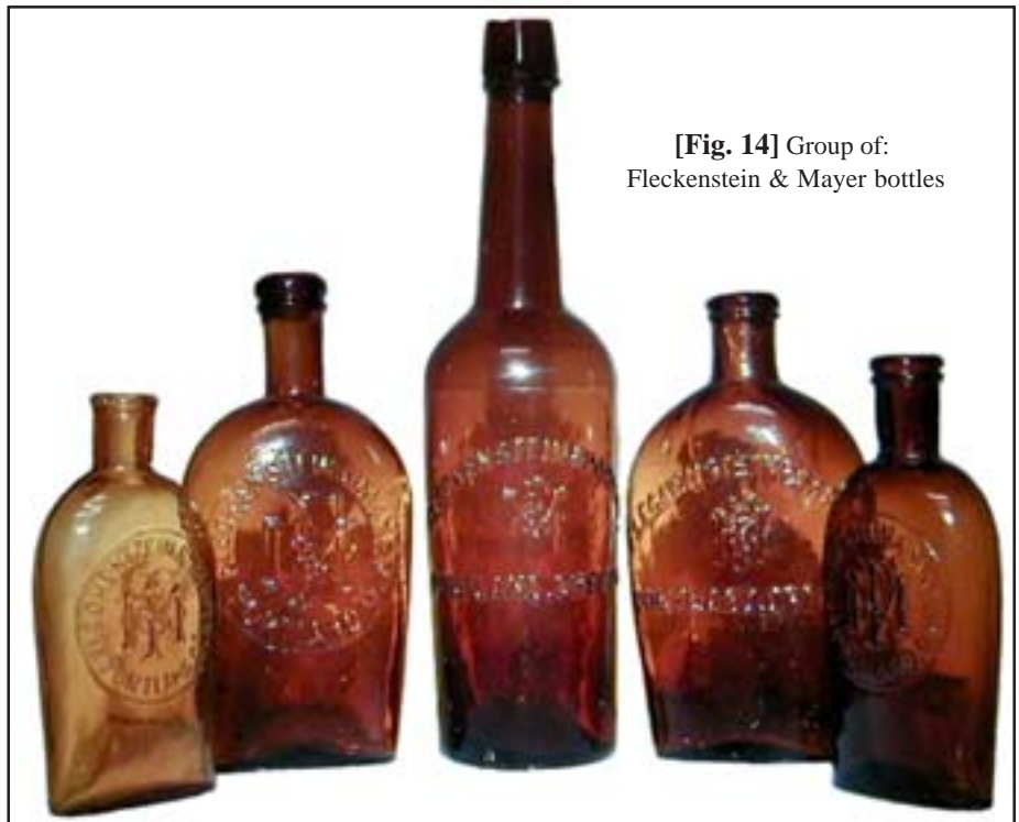
[Fig. 14] Group of: Fleckenstein & Mayer bottles

Add to this the crudity and tremendous color variation noted in these flasks and the demand for them becomes understandable. The most ardent collectors try to assemble a complete collection of the colored flasks. To my knowledge no-one has ever been able to make the claim that they once owned an example of every bottle. This is a testimony to the extreme rarity of certain of the bottles.