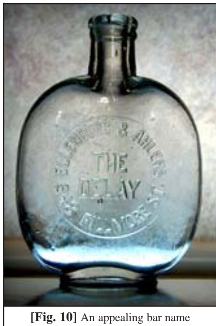
[Fig. 10] An appealing bar name