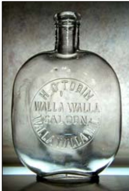
[Fig 8] Desirable Washington Territory "Saloon" pumpkinseed

The following listing will give an idea of what is available from each of the states west of the Rockies: