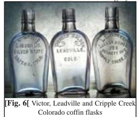
[Fig. 6] Victor, Leadville and Cripple Creek Colorado coffin flasks

Another flask that fits this category is