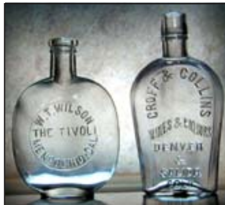
[Fig 5] Rare California pumpkinseed flask and common Colorado coffin

The local appeal effect for one given community is well demonstrated by the A. Weinberg flask [Fig. 7] from Tacoma, Washington Territory.