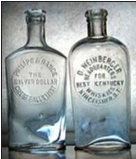
[Fig. 4] Olympia and strap-sided flasks

Seldom does a severely damaged specimen warrant more than a few dollars as an example for the "Crier" shelf. But, with a very rare bottle, the occasional surprise occurs - as an instance, a Gem Saloon coffin flask from Elko, Nevada, with a blown-out shoulder recently realized $170 on EBay. This is an instance of rarity (only two other specimens known) outweighing condition as a factor in determining value.