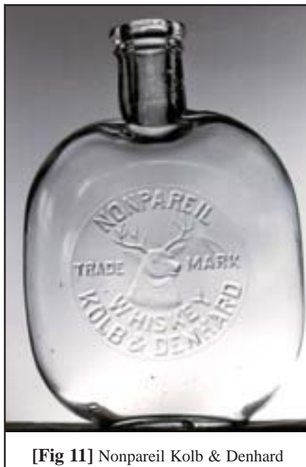
[Fig 11] Nonpareil Kolb & Denhard