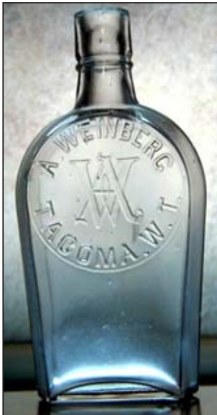
[Fig. 7] A. Weinberg Tacoma W.T. coffin flask

Other areas of collecting that are of note include collecting flasks with unusual sayings such as the S.F. Rose pumpkinseed from Vallejo embossed "Straight Goods From The Wood" and flasks with