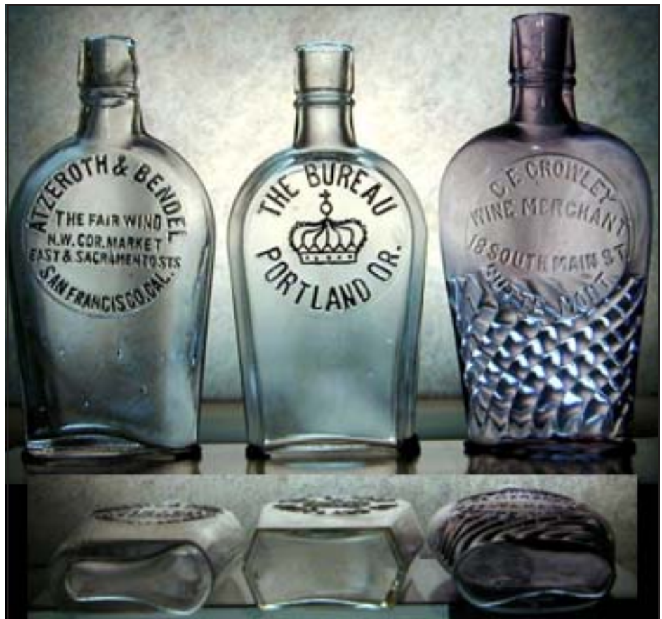
[Fig. 2] Left to Right: Shoofly, Coffin and basket-base Shoofly flasks

area west of the Rockies, although the style was quite popular in Texas and Oklahoma Territory.