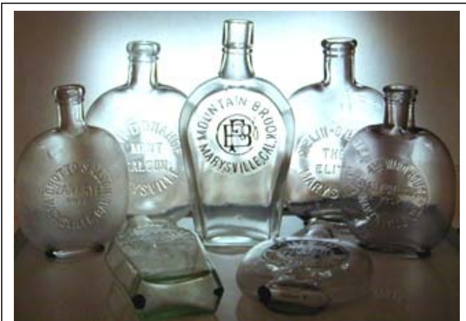
[Fig. 3] A grouping of Marysville, California Coffin and Pumpkinseed flasks

Nicks, chips, bruises and other more serious damage truly does affect value. This is particularly true in the more common bottles.