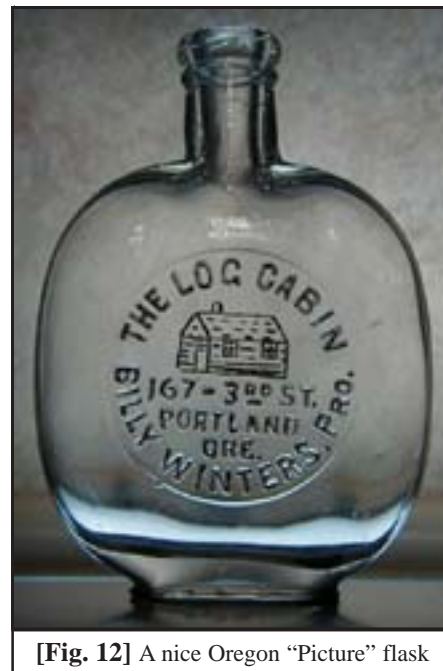
[Fig. 12] A nice Oregon "Picture" flask

go with fifteen shooflies, four basket-base shooflies, three olympia-style, one screw-cap pumpkinseed and two double-ring top pumpkinseeds.