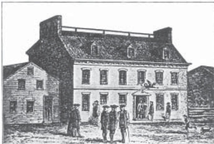
Green Dragon Tavern.

The Cromwell’s Head Tavern of Boston was owned by the Bracket Family. It was a high class hotel and they served wine, punch, porter, and liquor. A Virginian, George Washington stayed at the Cromwell and conferred with Governor Shirley on military activities.