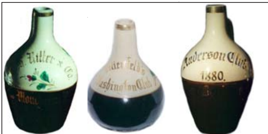
Left: A Ritter & Co. of Detroit was the distributor of the Mellow Monogram Whiskey in this Fulper jug. This company first appears in Detroit business directories in 1892 and ceased business 24 years later with the advent of Prohibition. Middle: Filenfeld's Washington Club appears to be a Fulper product but is an unusual bulbous shaped and features a "kick-up" base. Right: Anderson Club was registered in 1906 as a brand from Charles Shaffner & Co. of Chicago.

Thereby lies a problem, however, since the gold lettering did not adhere well to the smooth dark body surface, and on many examples, the decoration is badly