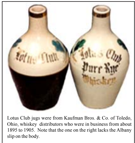
Lotus Club jugs were from Kaufman Bros. & Co. of Toledo, Ohio, whiskey distributors who were in business from about 1895 to 1905. Note that the one on the right lacks the Albany slip on the body.

He noted that until he saw my photos of these jugs, he had wondered what items were being decorated in the low-fire kiln since none had ever come to his attention. He knows of no catalogs or other paper records for this line of ceramics, except