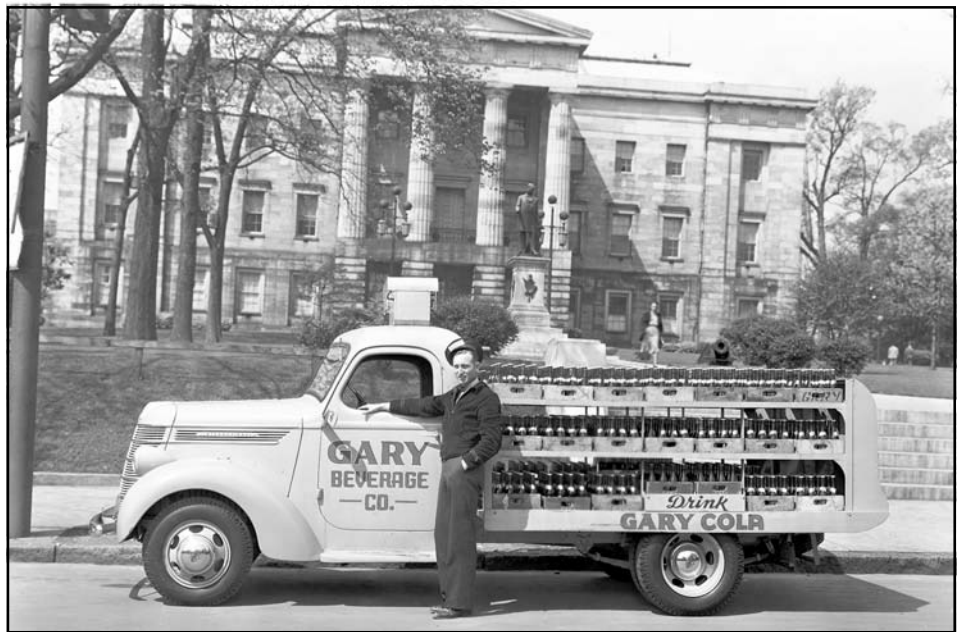
Gary Beverage Company delivery truck, driver in front of North Carolina's state capitol in Raeligh, circa 1935.

Above: Door sticker illustrating a green paper-labeled Gary's Ginger Ale bottle. Sticker was manufactured by Mystik Division, Chicago Show Printing Co.