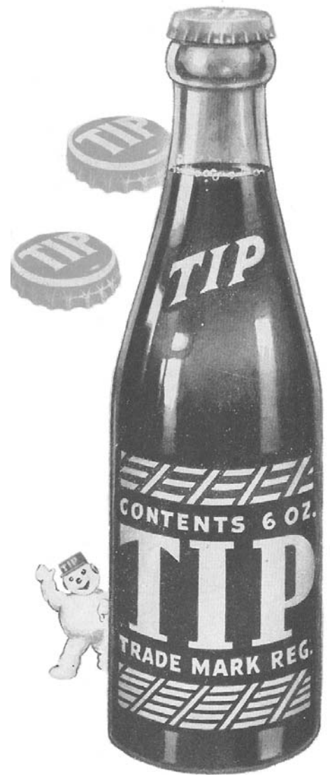
Illustration of a TIP bottle from an ad in the American Carbonator & Bottler . The 6-ounce bottles were lettered in white Applied Color Labeling with orange crown caps.