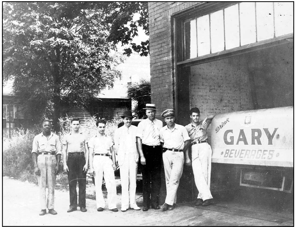
Unidentified staff of the Gary Beverage Co., in High Point about 1935.