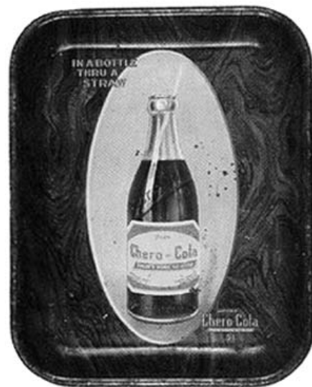
Chero-Cola advertising serving tray from the teens.