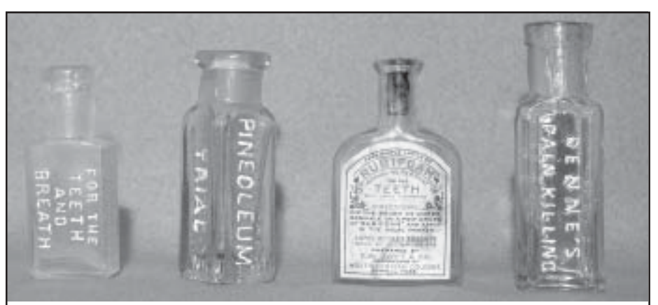
Photo 9: Medicine (L-R) SOZODANT FOR THE TEETH AND BREATH; PINEOLEUM TRIAL PHYSICIANS; SAMPLE RUBIFOAM FOR THE TEETH (on opposite label side); RENE'S PAIN KILLING SAMPLE MAGIC OIL TRY IT.