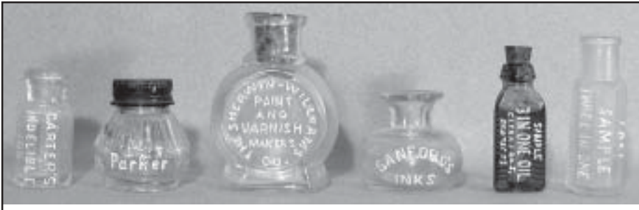
Photo 7: (L-R) CARTER'S INDELIBLE INK; PARKER QINK; THE SHERWIN WILLIAMS PAINT AND VARNISH MAKERS; SANFDORD'S INKS; two SAMPLE THREE IN ONE OIL.