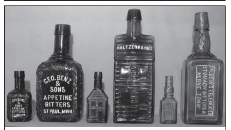
Photo 6: Bitters (L-R) GEO BENZ & SONS APPETINE BITTERS, sample and full size; HOLTZERMAN'S PATENT STOMACH BITTERS; DR.LOEWS CELEBRATED STOMACH BITTERS (very small 1/8" letters on the sample).