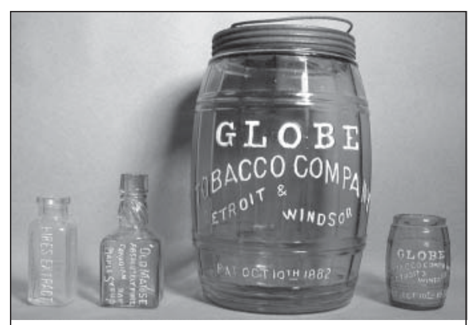
Photo 4: Food & tobacco (L-R) HIRES EXTRACT/FOR HOME USE; OLD MANSE CANA-DIAN SAP MAPLE SYRUP; GLOBE TOBACCO COMPANY DETROIT & WINDSOR full size: GLOBE TOBACCO COMPANY DETROIT & WINDSOR 2 1/4" sample size.