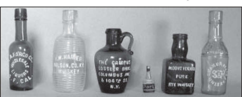
Photo 1: Spirits (L-R) E,A,FARGO CO. WHOLESALE LIQUORS S.F. CAL. whiskey; I.W.HARPER whiskey THE CAMPUS GOSSLER BROS. COLUMBUS AVE & 104TH. ST. N.Y. Liquor; PORT (paper label 1 1/4" tall); MT. VERNON PURE RYE WHISKEY; QUAKER MAID WHISKEY