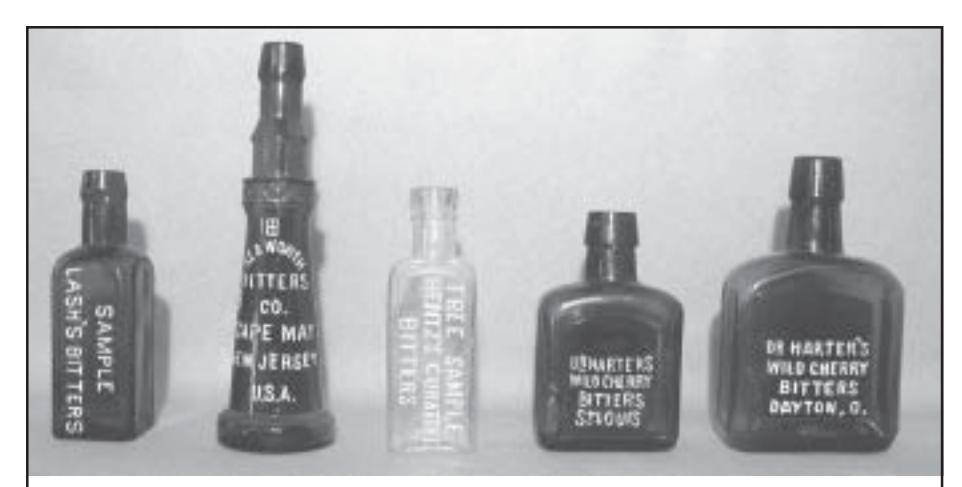
Photo 5: Bitters (L-R) LASH'S BITTERS SAMPLE; SEAWORTH BITTERS CO. CAPE MAY NEW JERSEY U.S.A.; HENTZ'S CURATIVE BITTERS; DR. HARTERS WILD CHERRY BITTERS 3 ¾" and 4 ½", FREE SAMPLE.