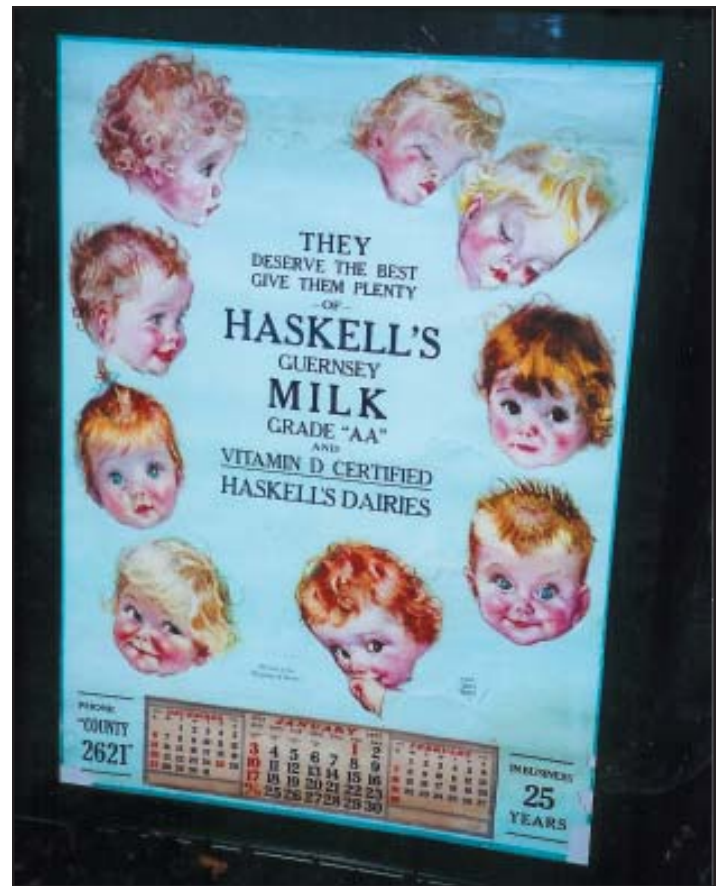
Take your pick of these photogenic babies, all on the 1937 calendar.

Bill Baab 2352 Devere Street Augusta, GA 30904 (706) 736-8097 riverswamper@comcast.net