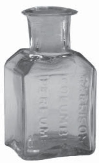
Harrison perfume bottle.