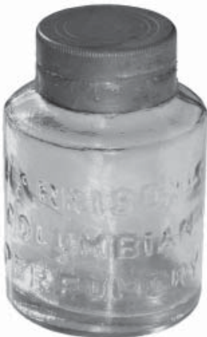
Harrison Perfume with pewter lid.