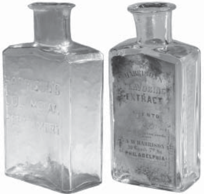
Article heading: Early Hair Dye bottles with reversed S’s. Above left: Harrison's Columbian Perfumery embossed bottle. Above right: Embossed and labeled flavoring extract.