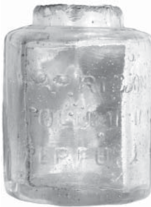
Harrison eight-sided perfume.