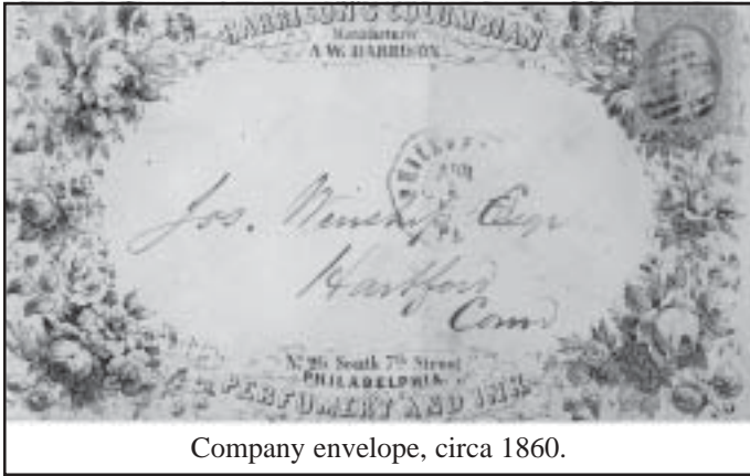
Company envelope, circa 1860.