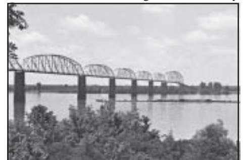
Figure 7: From a postcard, the Cobb Bridge over the Ohio River.