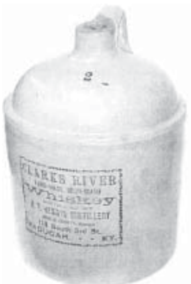
Figure 5: "Clark's River" Whiskey, from H.T. Hessig Distillery, Paducah.

and much too good for many of the others."