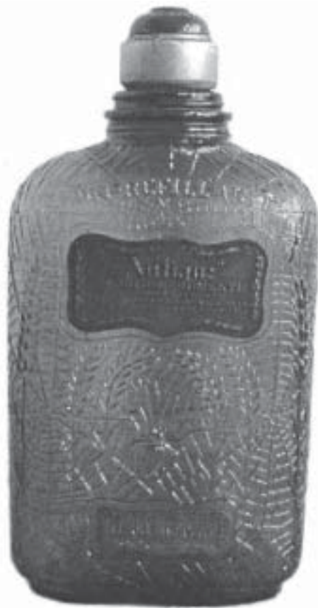
Figure 8: Frankfurt Distillery 1920s bottle of “medicinal” whiskey.

being one of a few firms that received permits to produce “medicinal” whiskey, which it sold as “spiritus frumenti alcoholic stimulant,” omitting the word “whiskey.” [Figure 8] Providing some 25 percent of the national supply, its literature later