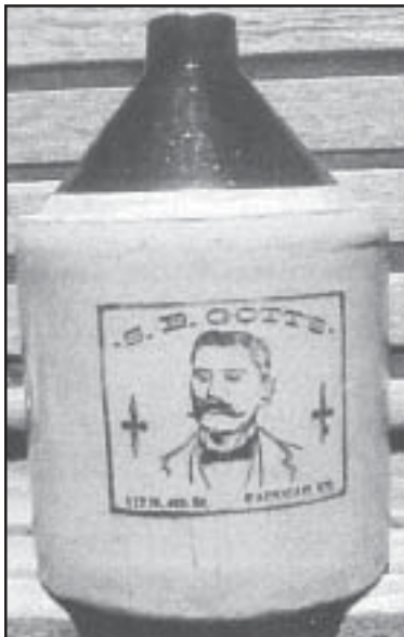
Figure 4: S.B. Gott jug, Paducah.