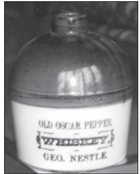
Figure 10: An Old Oscar Pepper jug.

A 1937 movie he wrote was a critical and popular flop. The New York Times wrote: “Mr. Cobb...presents the appalling spectacle of a man who is not merely beyond his depth but insists on showing off as he goes down for the third time.” Increasingly he began to espouse conservative causes and to write demeaningly about Negro