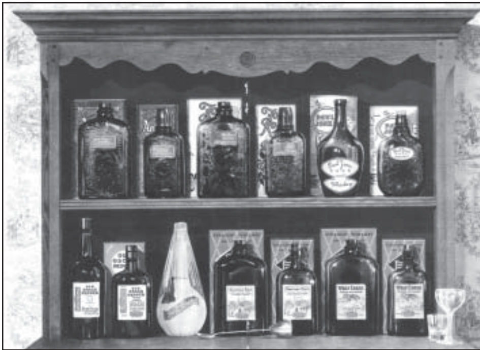
Figure 12: The centerpiece of the Cobb Recipe Book.