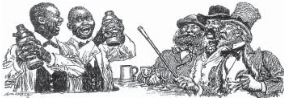
Figure 13: An illustration from the recipe book.

Americans. In 1941 his national column, which had run continuously since 1922, was canceled. In failing health throughout the early 1940s, Cobb, 68, died on March 10, 1944. He was buried in Paducah's Oak Grove Cemetery. The inscription on his stone says simply "Irvin Shewsbury Cobb, 1876-1944, "Back Home" [Figure 14].