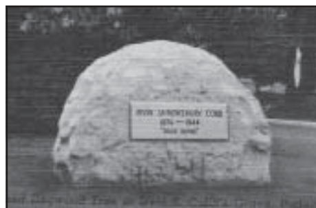
Figure 14: From a postcard, the Cobb grave site.

In the 62 years since his death he has become a forgotten man. Yet Irvin S. Cobb can be remembered with honor for his role in ending Prohibition, the "Great Experiment" that became a great disaster.