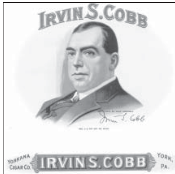
Figure 1: From the lid of an Irvin S. Cobb cigar box.