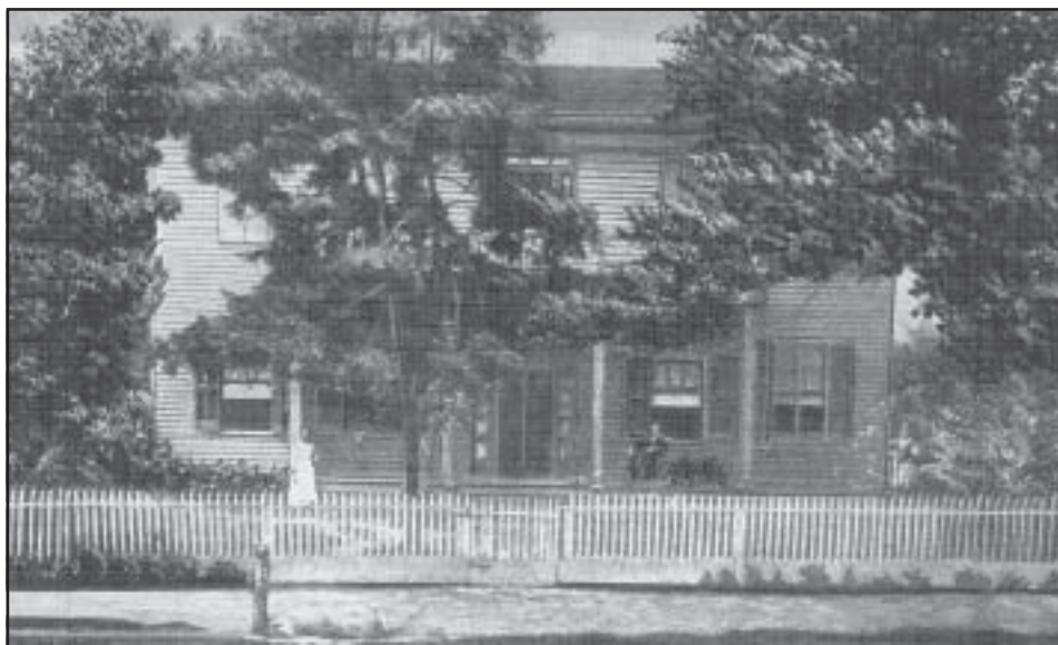
Figure 2: From a postcard, the birth place of Irvin S. Cobb. The house was torn down in 1914.

National Prohibition also fell hard on Cobb. At first he dealt with it humorously, writing that: "Since Prohibition came in and a hiccup became a mark of affluence instead of a social error as formerly, and a loaded flank is a sign of hospitality rather than of menace, things may have changed." And again: "Booze is a bad thing for some people