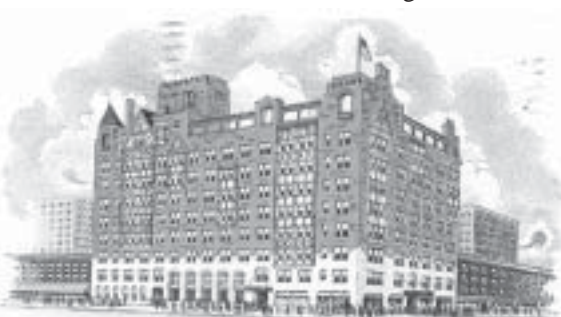
Figure 6: From a postcard, the Irvin S. Cobb Hotel, Paducah.