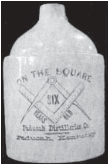
Figure 3: "On the Square" Whiskey, Paducah Distilleries.