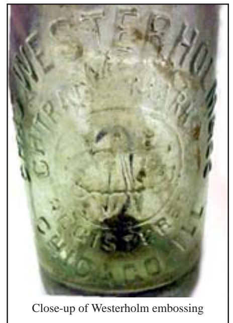
Close-up of Westerholm embossing