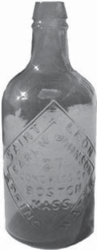
St. Leon quart