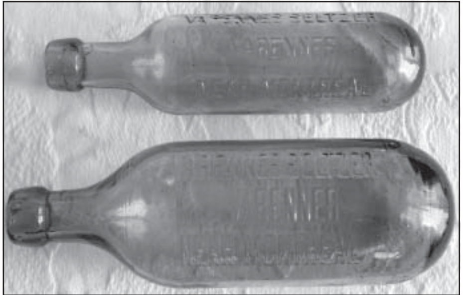
Varenes Seltzer bottles, pint and quart.

To date, no marked bottles from the Varenes Springs have been found from the 1840-1859 period. The most fascinating reminders of the second era of Varenes are two cornflower blue round