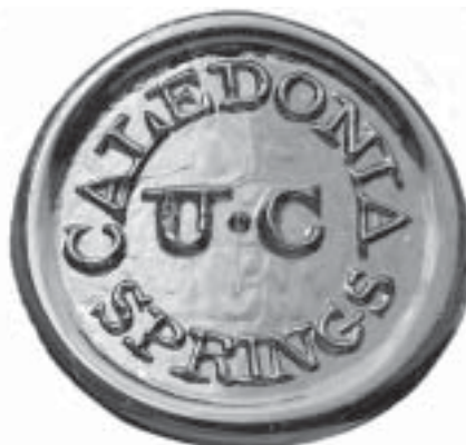
Above: Close-up of Caledonia Springs seal. Right: Caledonia Springs, U.C. black glass, quart bottle.

The next known Caledonia Springs water bottle is an aqua blob-top pint from the 1890s. Clearly, tens of thousands of bottles were shipped from Caledonia Springs from 1841-1890, but in what sort of bottle? I hope that future digs will provide answers.