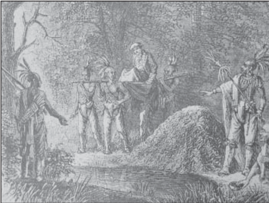
Figure 3: Early woodcut of Johnson being carried to the healing spring.

The Mohawk chiefs held a council. About 30 miles northeast of Johnstown, in a little wooded valley at the edge of the Adirondacks, were the “Medicine Springs of the Great Spirit,” whose waters had repaired and renewed the Iroquois for nearly 400 years. The sachems decided that if Johnson were to be cured, they must transport him to the magical springs. On August 22, 1767, an escort of Iroquois braves set out from Johnson Hall, carrying their friend on a litter. Although rumors had abounded for years about a spring with