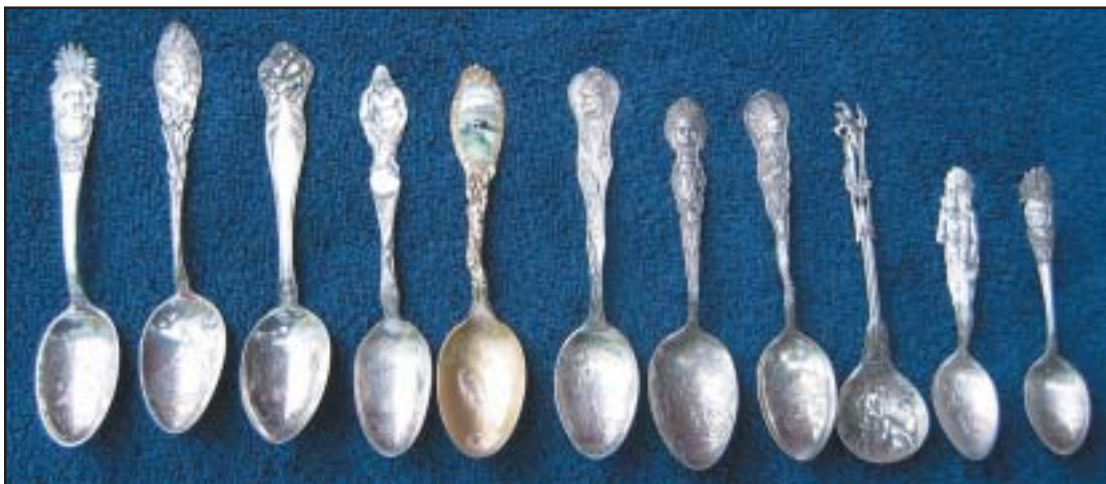
Figure 2, below : A few of the many variations of High Rock souvenir spoons Close-up on right shows the detail of one of the spoon bowls. Each one is different.