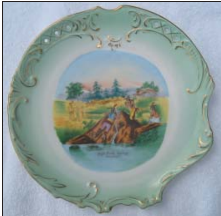
Figure 1, above: Souvenir plates from Saratoga, showing the High Rock Spring.