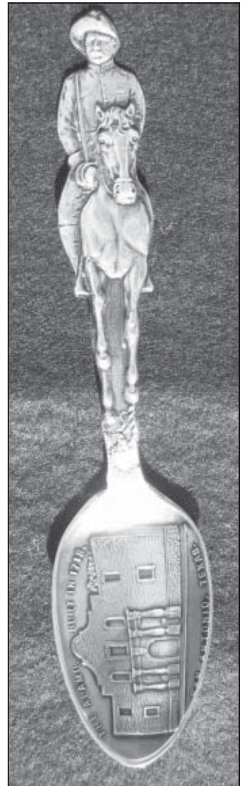
Figure 5: Sterling souvenir spoon featuring Teddy Roosevelt and the Alamo.