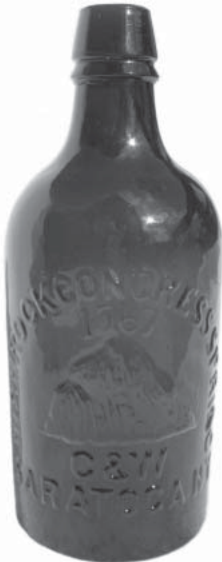
Figure 4: A "High Rock" bottle showing the embossed 1767 date.

As the entourage neared the spring, he saw a strange cone-shaped rock, about five feet tall, and resembling a small haystack. Water poured from a round hole in the top of the rock and ran down its sides. [Figure 3] The Indians built a bark hut close to the spring and scattered leaves for Johnson to lie on. For four days, he drank and bathed in the salty waters of the spring. [Figure 4] The Indians built a bark hut close to the spring and scattered leaves for Johnson to lie on. For four days, he drank and bathed in the salty waters of the spring. On the fourth day, a runner arrived with news that required the baronet to hurry home. The death of one of the chiefs and new land disputes between the settlers and Indians required his immediate attention. Much to Johnson's surprise, his brief visit to the spring restored much of his strength and he was able to walk part of the way home. News of his miraculous cure traveled