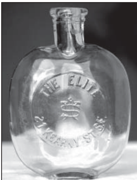
The Elite / 21 Kearny St S.F.