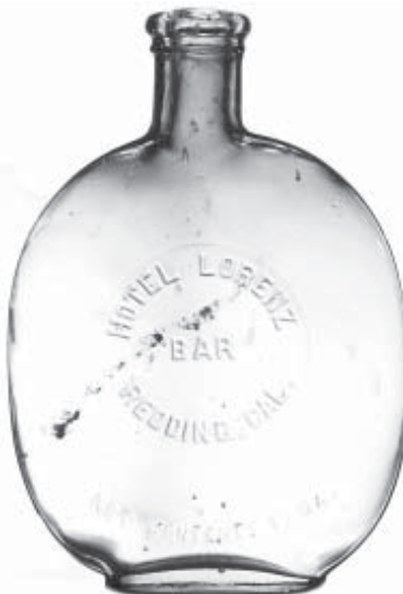
Hotel Lorenz Bar / Redding, Cal.