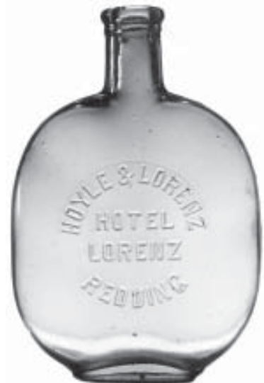
Hoyle & Lorenz / Hotel Lorenz / Redding