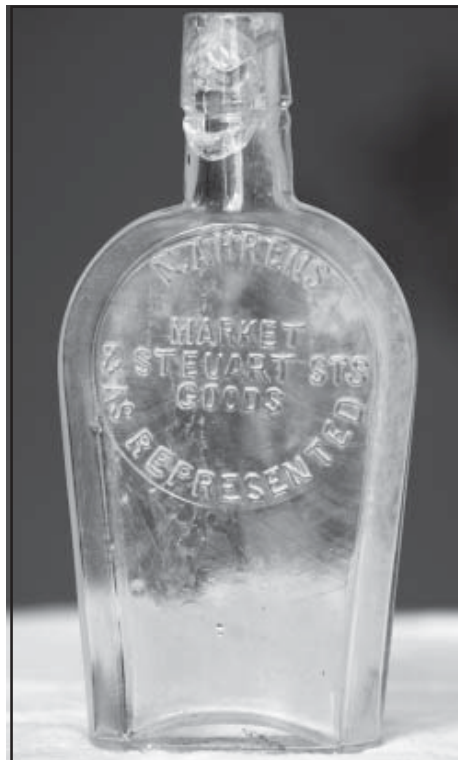
N. Ahrens / Market / & Steuart Sts / Goods / As Represented