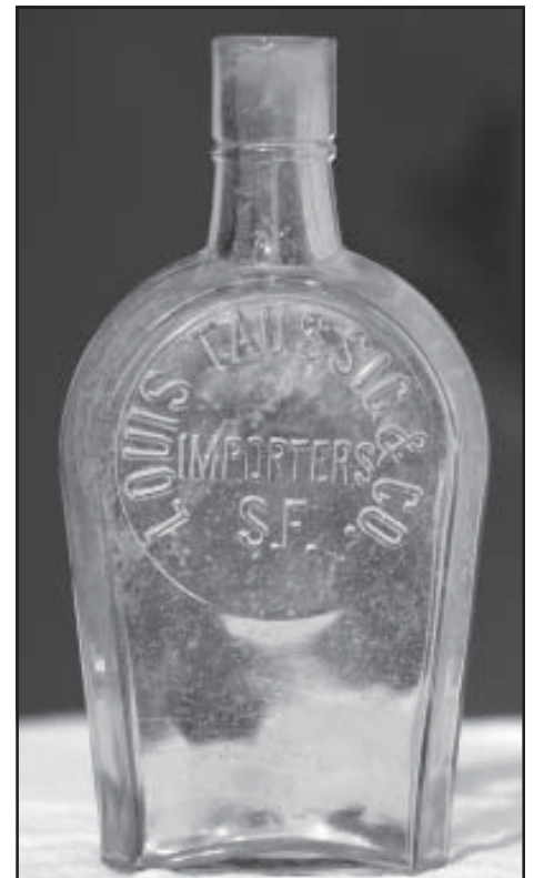
Louis Taussig & Co / Importers / S.F.