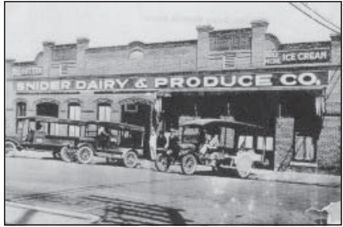
28-32 North Bartlett Street, circa 1921.