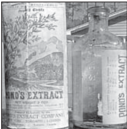
Pond's Extract embossed bottle with packaging. From the Pond's Extract Company. Note the package has a flowering shrub on the front. No doubt an image of Witch Hazel.