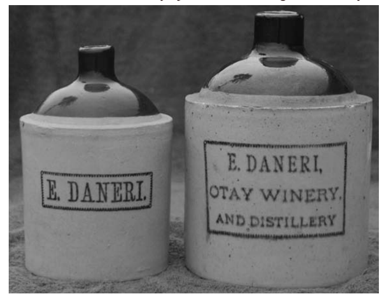
Jugs came in three sizes: quart, half-gallon, and gallon. Embossed on bottom: Macomb Pottery Co. Macomb, Ill. Pat Jan 24 1899