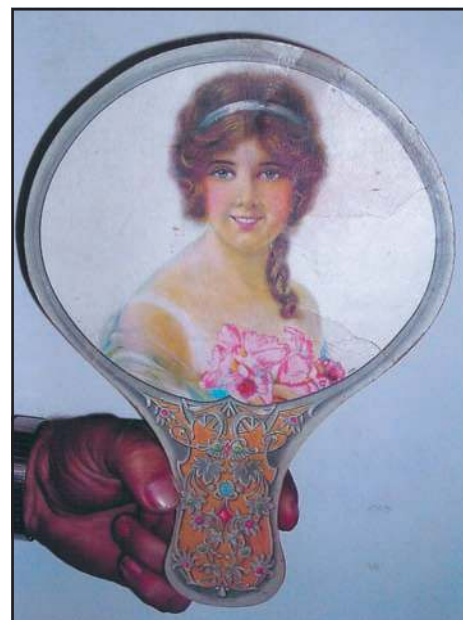
Gay-Ola fan, front.