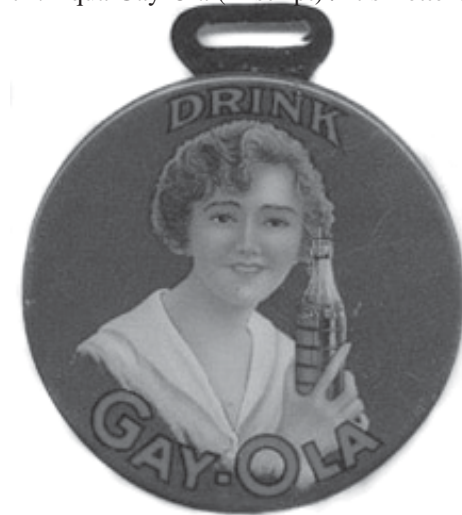
Circa 1900 pocket mirror / watch fob, "Drink Gay-Ola, sold on eBay for $191.