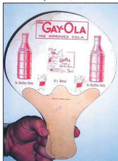
Gay-Ola fan, back.

competitor to court in February, 1911, on charges of trade mark infringement. The Gay-Ola Company won the initial lawsuit, but lost on appeal and was forced to change their script trade mark to block letter.”