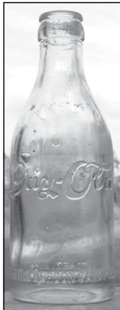
Gay-Ola bottled by the Salvo & Berdon Candy Co., Natchez, Miss.

104. Aqua 24 Fl. Ozs. "REGISTERED" Gay-Ola Bottling Co., Madison, Ill.