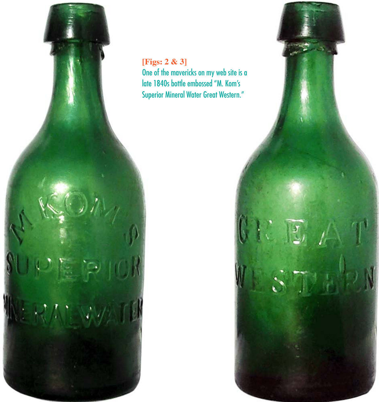
[Figs: 2 & 3]

One of the mavericks on my web site is a late 1840s bottle embossed "M. Kom's Superior Mineral Water Great Western."