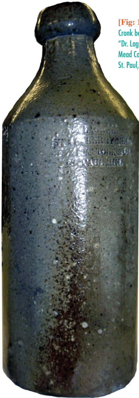
[Fig: 1] Cronk beer impressed "Dr. Laglee's Strawberry Mead Comstock & Co., St. Paul, Minn."

in Saint Paul, but the name of the manufacturer is not mentioned. This would seem to narrow things down a bit. There were no mineral water makers in Saint Paul in 1854, but there was in 1856. We just need to prove it was Comstock.