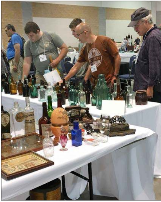
Buyers check out the offerings from the more than 100 dealers set up here.