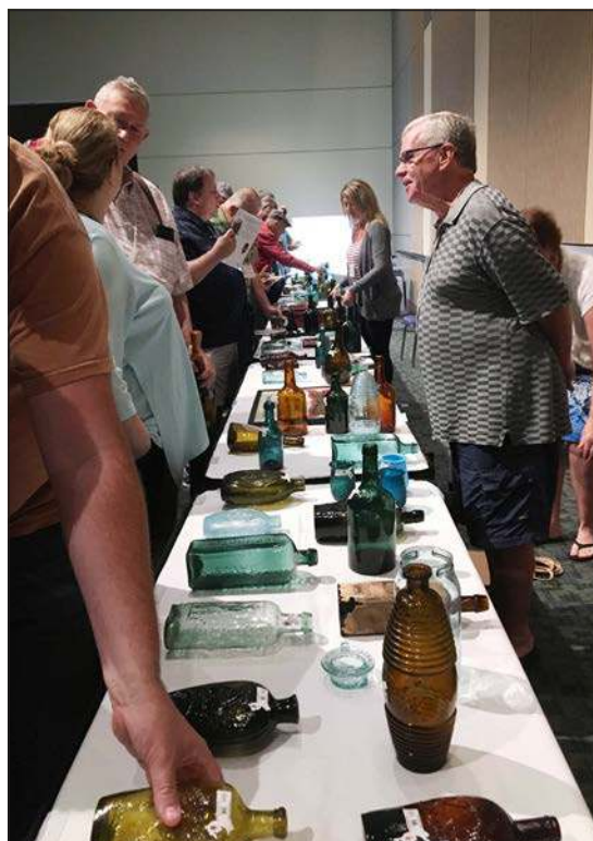
Bidders check out the auction offerings before the sale got underway Saturday morning.