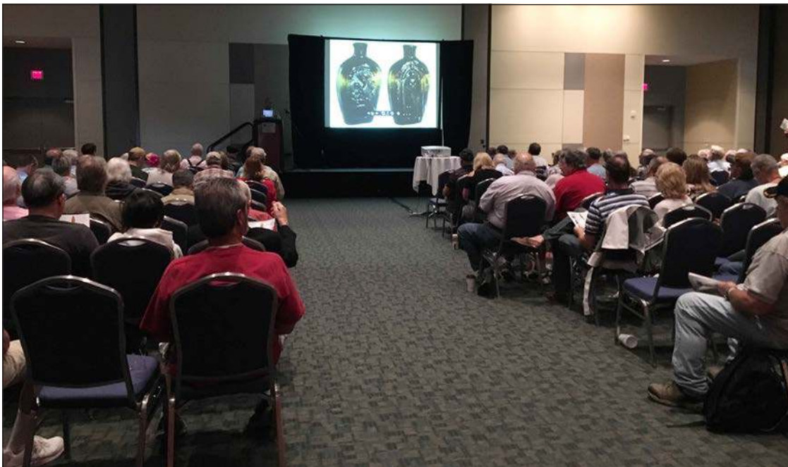
The auction was short and sweet, selling just over 100 lots in about 90 minutes, and gathered a good-sized crowd.

For additional information, www.fohbc.org .