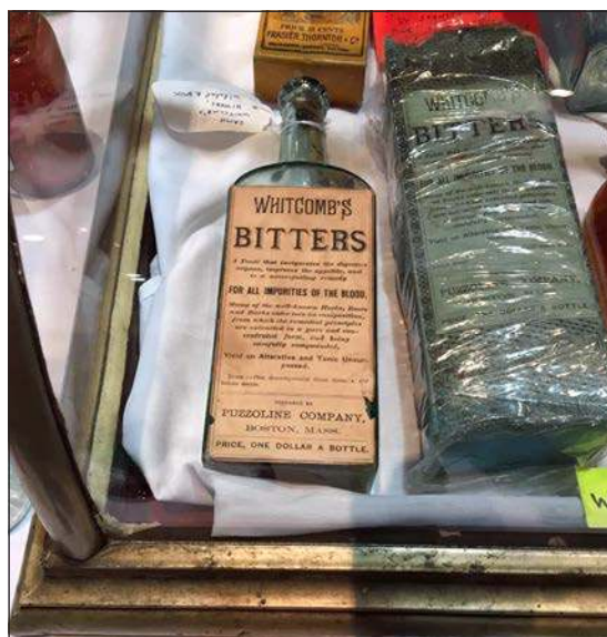
Said to be a "never-failing remedy for all impurities of the blood," a bottle of Whitcomb's Bitters was on display at Andy Lange, Plymouth, Mass. The cost when it was manufactured? $1 a bottle.