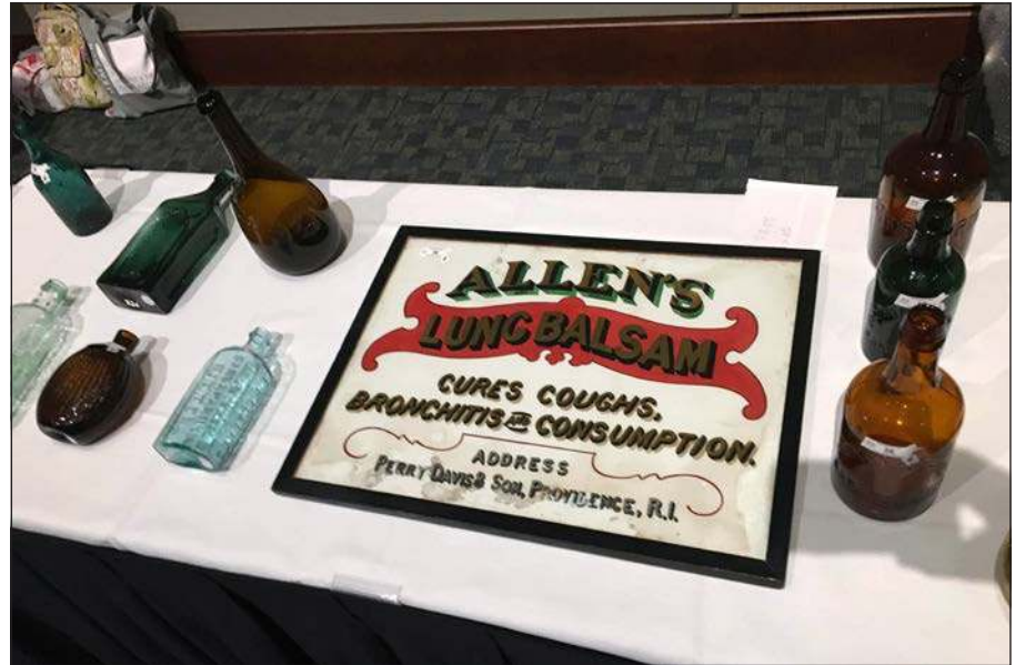
More than bottles crossed the block. This reverse painted glass advertising sign for Allen's Lung Balsam went out at $585.