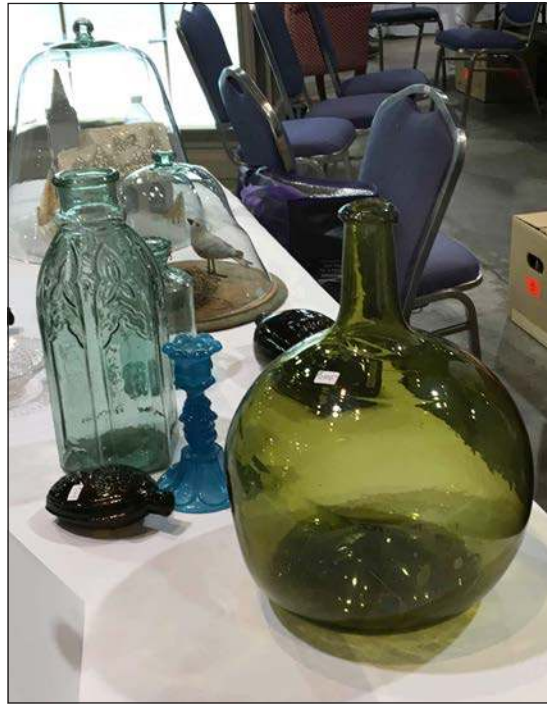
Norman C. Heckler & Co, Woodstock Valley, Conn.