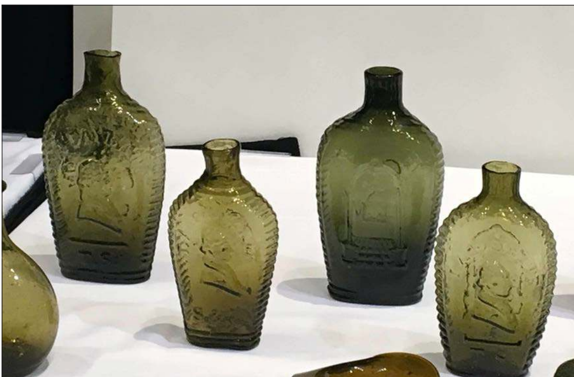
Among the educational displays at the show, set apart from the selling floor, was the Rick Ciralli collection, Bristol, Conn., with a fine grouping of olive green flasks.