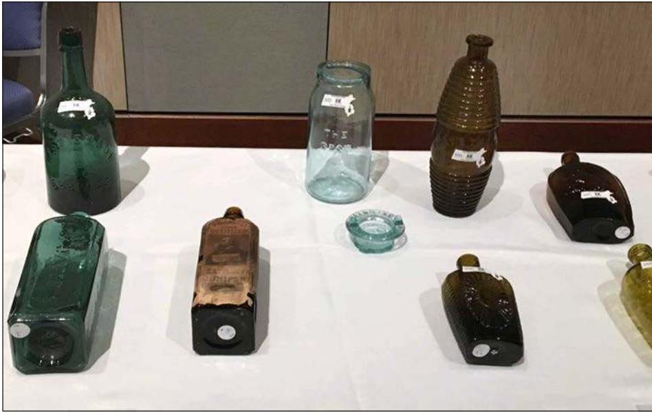
Bottles in colors ranging from light aqua to olive green and dark amber crossed the block.