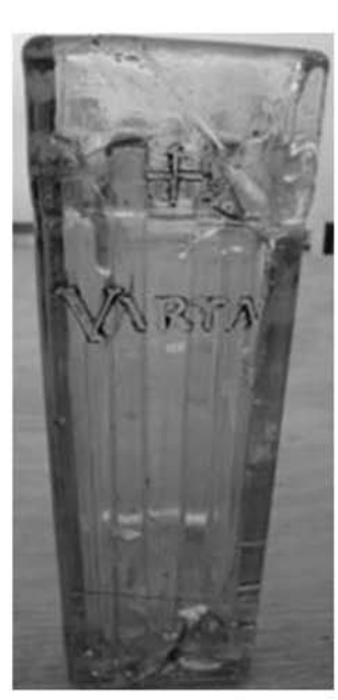
Contact: Claudio Oiticica 2620 Arrandell Rd