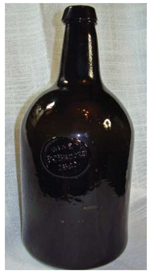
Almost cylindrical but still a bit wide, this form will soon grow taller and thinner. Sealed wine P.C. Brooks, 1820