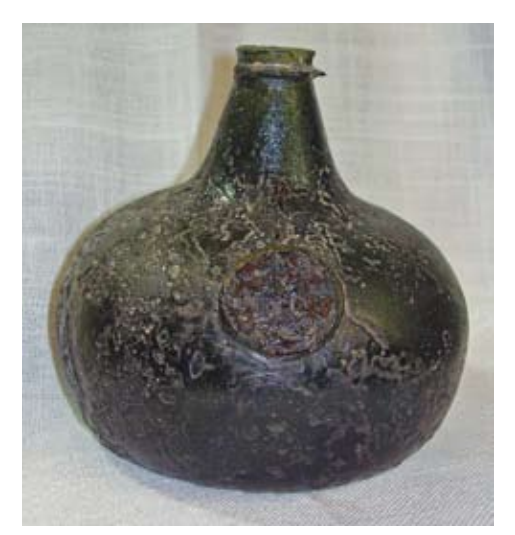
Onion form, seal not legible because of long burial in ground, circa 1700–1720.

and a couple that are almost certain to have been produced on North American soil, either at a New York glass house or even at Wistarburgh, according to some bottle historians. As an American, I've perceived our closest link with English bottles, followed by German, Dutch, and the like. I now realize, however, that history proves early bottle production was a world-wide affair, with forms intertwining, distinct yet parallel in their evolution, with each "new" form emerging from its predecessor.