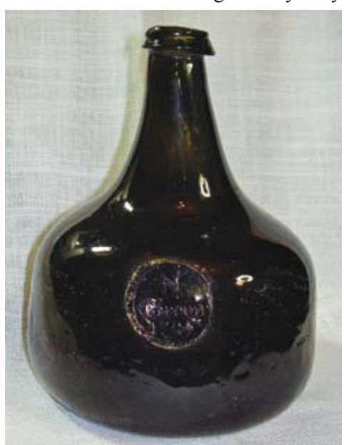
Very late straight-sided onion beginning to show mallet characteristics. Sealed N. Green 1724. American attribution.

Now, what is a glass-sealed bottle? First, there are many types of sealed bottles that are not categorized as Black Glass—many whiskeys and the familiar Bininger bottles, just to name a couple. But here we are discussing the very early