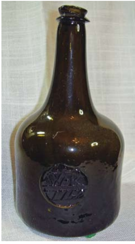
Mallet form, sealed W.R. 1752

Early seals might be of a crest, a coat of arms, the symbol of a tavern or pub, or the name of a titled individual. A bit later, universities and other institutions began to use seals. Personal names, initials, and dates soon followed, and