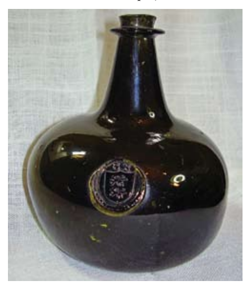
Sealed G.S. with two lions rampant, late shaft-and-globe/early onion form, circa 1690.

We know that Black Glass bottles were blown in America. A bottle is given an American attribution if, by its identifying seal, it can be shown to have belonged to a known colonist working and living here in North America—even if the bottle may have been blown, say, in England. Attribution is also accomplished through archeological work at known American glass house sites through shard evidence. Information proving specific examples is coming to light all the time (some bottles are known absolutely to have been blown in North America—the well-known RW sealed bottle, for example).