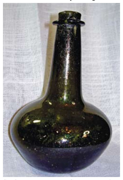
Shaft-and-globe Black Glass bottle, circa 1660.

Black Glass bottles were also produced in the American colonies, almost certainly beginning with Caspar Wistar's first "successful" glass house in 1739. Though indisputable attribution of specific examples is sometimes still debated and perhaps difficult to prove, bottles of this type are strongly thought or known to have been produced by Wistar and later by others. One factor at play here is that the same German, Polish, Dutch, and other glass-blowers who worked in Europe emigrated to