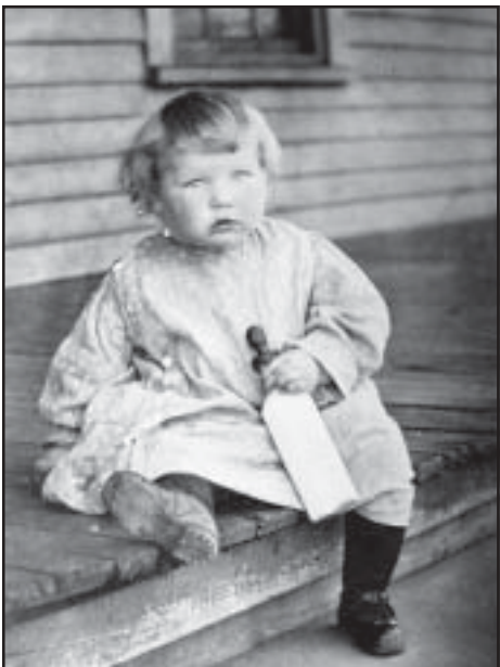
A little girl on the front porch of her home holding a Patent Medicine bottle with a huge nipple on it. Note the hob-nailed boots that she is wearing. This photo was most likely taken by a traveling photographer, of which there were many roaming the countryside. The photo probably dates to about 1900.

We were obtaining photographic proof of the use of different whiskey and old patent medicine bottles being used as baby