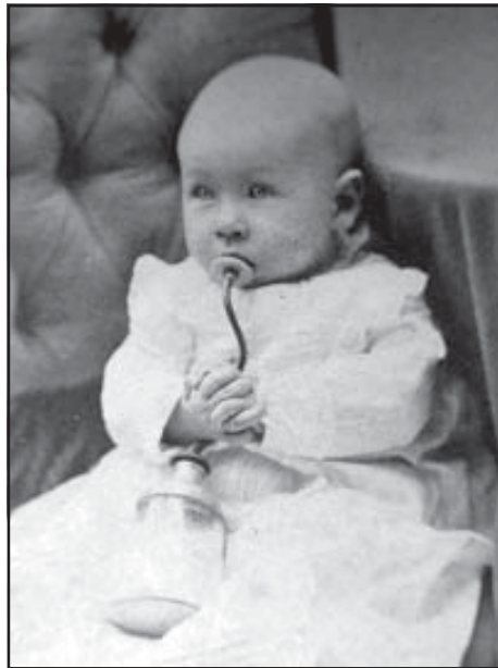
This baby is sucking its milk from the very scarce La Forme's Nursing Bottle which was patented in 1859. I firmly believe that some of this type baby bottle may actually be residing in someone's collection of Ink Wells. The photo probably dates not much later than the 1880s.

Do you have some favorite photos of babies with their Feeding Bottles? Please make some good scans and send them in to us for future use in articles for Bottles and Extras or for the ACIF's "Keeping Abreast."