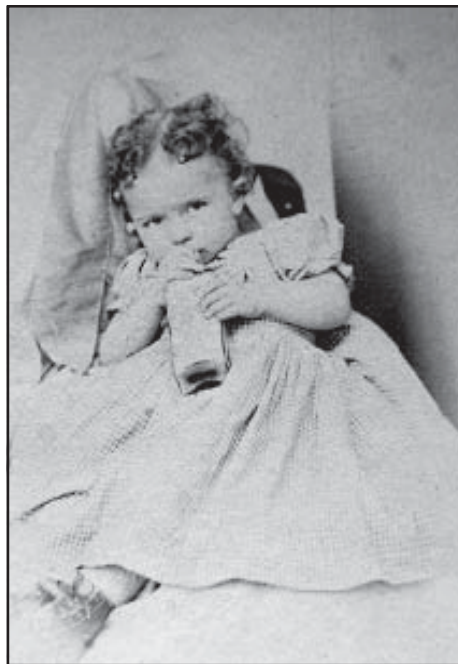
A wonderful studio shot of a little girl with her rectangular Patent Medicine bottle with the nipple in her mouth. This photo was taken about 1860.