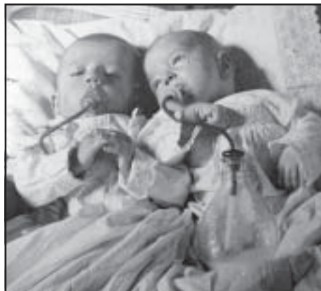
This photo appears to be twins, both sucking out of murder bottles. The bottle on the left is mostly hidden, but the one on the right is very readable as to the maker. It is embossed "PERFECT CRADLE NURSER." They appear to be very happy suckers.