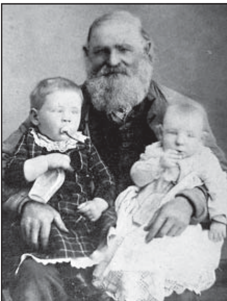
This is one of my favorites. It is Grandpa with two little ones on his lap. Both are using the Murder Bottles with the nipple ends in their mouths. On the left you can also see the ivory disc that prevents the swallowing of the nipple. The left child is using the scarce Coffin (murder??) bottle while the younger one on the right is using a standard half-pint whiskey bottle. This photo dates about 1900-1910.