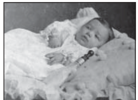
This happy little boy has just finished his meal from the Betsy Brown Nursing Flask. The nipple is huge, for this is only an 8-ounce bottle. It is easily identified by the aluminum collar that is screwed down over the nipple, keeping it from being pulled off.