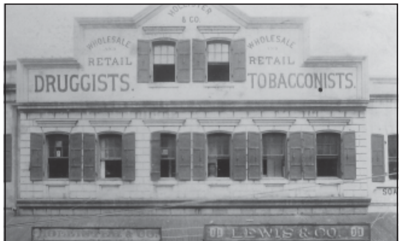
Side view of Hollister's on Fort Street. Second photo is of the front of the building.