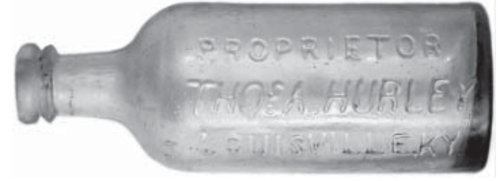
"Thos. A. Hurley" tonic bottle - probable product of the Louisville Glass Works, circa 1865

were unmarked, or marked with just a mold number or letter on the base.