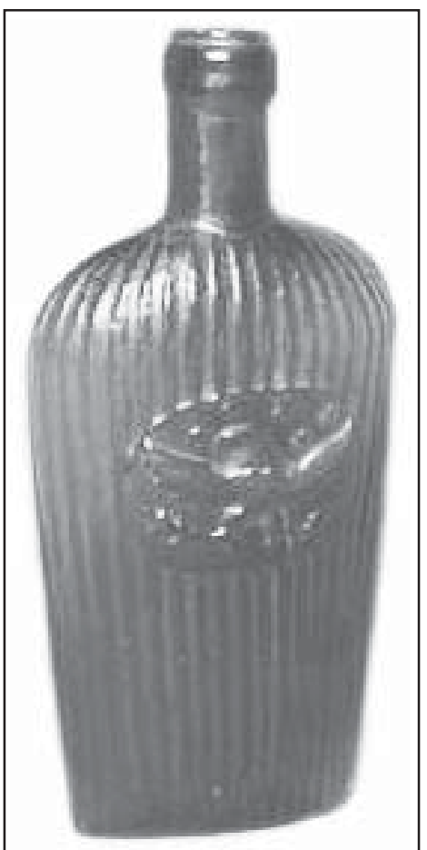
GII-33 Louisville Glass Works amber ribbed eagle flask (above) with close-up of mark (below).