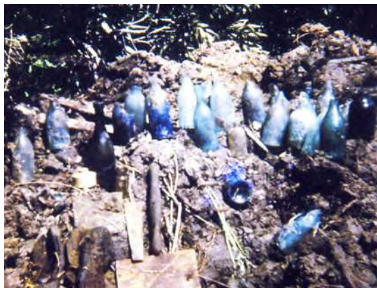
Bunch of John Ryan sodas, other bottles dug from privies along Indian Street, Savannah's red light district

on Saturday and dug into the black trash area until I hit a wall. I was in the middle of my first privy. So now I was looking for other construction sites to dig. J.C. Lewis Ford was torn down and a Downtowner motel built on the site. The construction crew started digging in March 1964. A dragline dumped a pile of dirt onto a 15-foot-high pile and all of a sudden these bottles came rolling down the dirt hill. So I