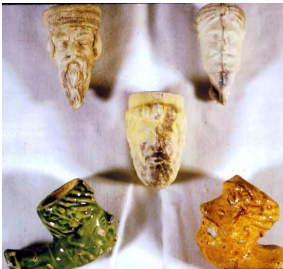
Figural pipe bowls dug by Bobby Hinely in Savannah, Georgia

After a couple of trips, I was run off by a railroad detective who said it was railroad property. So when we returned, it was at night and with a full moon, you didn't need a light, but the field was flat