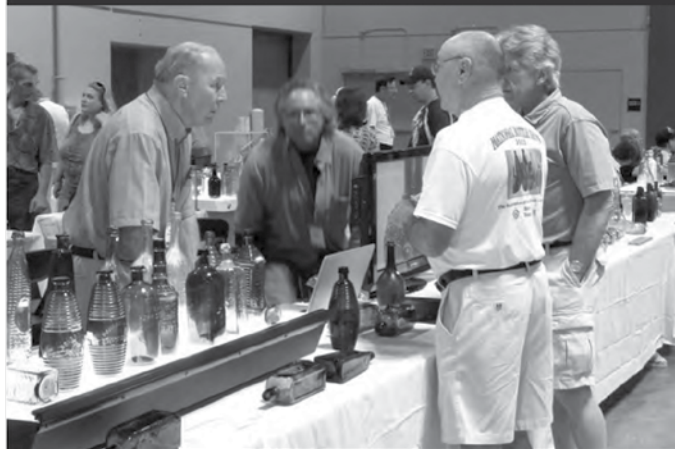
[Fig 8] Wheeling and Dealing at the Forbes, Ferraro and Meyer Tables.