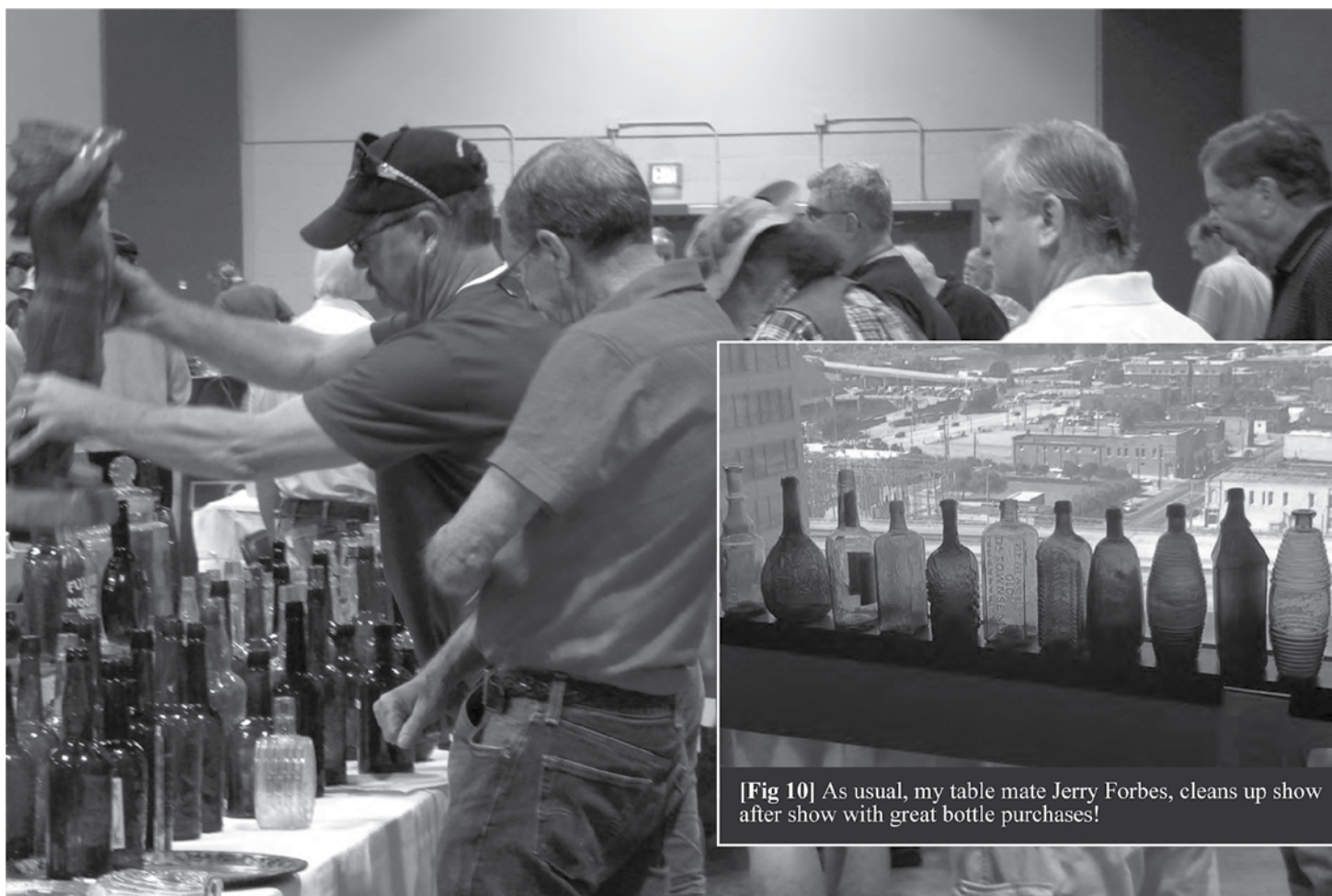
[Fig 9] Typical action at a table. Many buyers lined up to look at all of the great bottles and go with that typically show up. You have to move fast because when you go back a second time the item is gone like the Loaf of Bread demijohn bottle I missed!