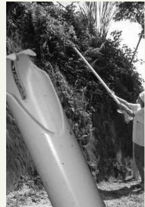
PVC Berry Picker

What can you do? Suck it up and bring extra band aids or take advantage of the possible added income and diversion created from those holes in the ground the party can do when not digging!!