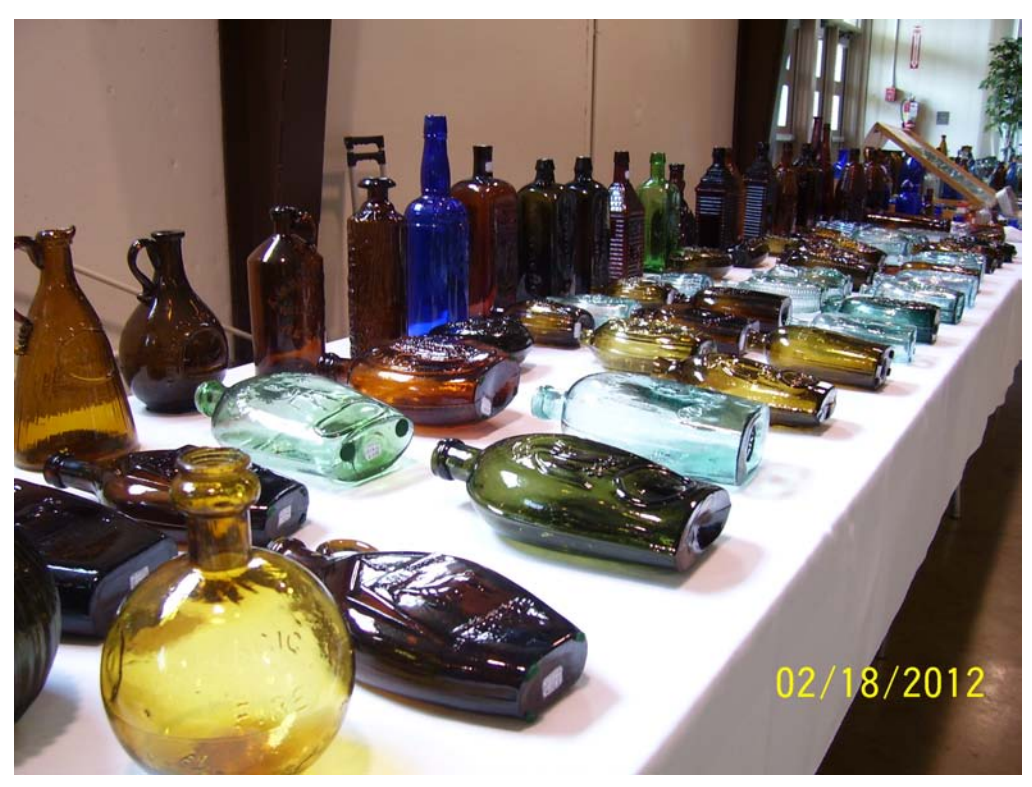
Nice collection of Historical Flasks from Jim Hall's table