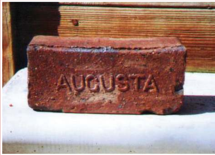
Here's an example of AUGUSTA brick

Cost of the project was $436,000. A post card published by the brick company shows a "view of State Highway #12 in Columbia County between Augusta and Atlanta showing part of more than 1,500,000 Augusta Block" used during the paving project.