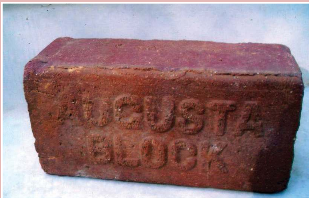
Augusta Block brick paved many streets throughout the Southeastern U.S. during first 50 years of 20 th century

Standard Paving Brick has been laid in thirty cities of the South Atlantic States without a failure.”