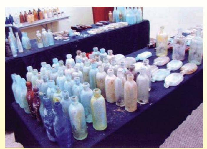
Blobtop and Hutchinson sodas, S.C. Dispensary flasks, round quarts, occupied this table. Cobalt blobtops were embossed Quinan & Studer / 1888 / Savannah, GA. (Taken Dec, 3 2011)