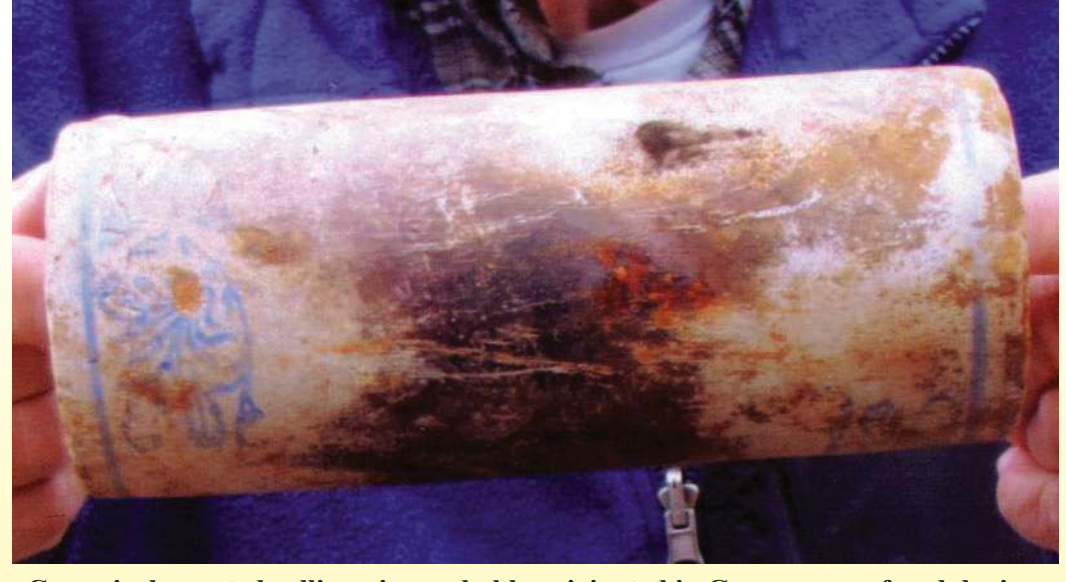
Ceramic decorated rolling pin, probably originated in Germany, surfaced during one of the digs.

Miscellaneous bottles found included a tall, clear bottle embossed Scalp Food, Cranitonic Hair Food, Cranitonic Hair Food Co., Paris, London and N.Y. A Walton's Dairy pint and a pair of hock wines completed that category.