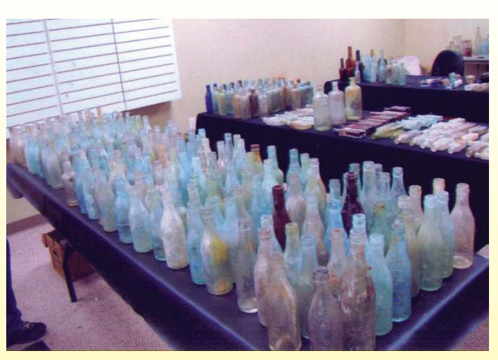
A few of the more than 450 straight-sided Coca-Colas excavated. Amber ones at far end of table were from Nashville, Tenn(Taken Dec. 3, 2011)

of the dig), a straight-sided Pepsi-Cola from Asheville, N.C., and an aqua E. Sheehan Hutchinson.