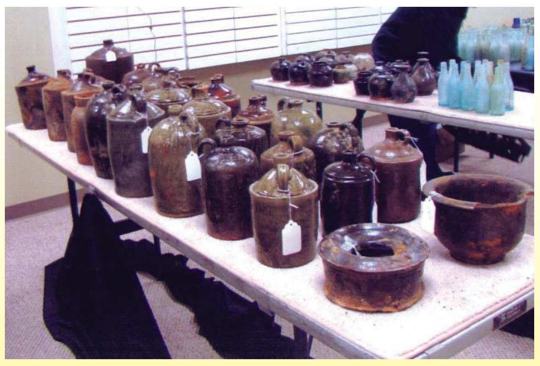
Spittoon (front left), "thunder mug" amoung 130 pieces of pottery dug from mill supply dump. (Taken Dec. 3, 2011)

Hutchinson, an aqua Clinton Bottling Works blobtop, a clear E. Sheehan Bottler Hutchinson, a ten pin-shaped Hire's Root Beer, a Baldowski Bottling Works and two Augusta straightsided Pepsi-Colas.