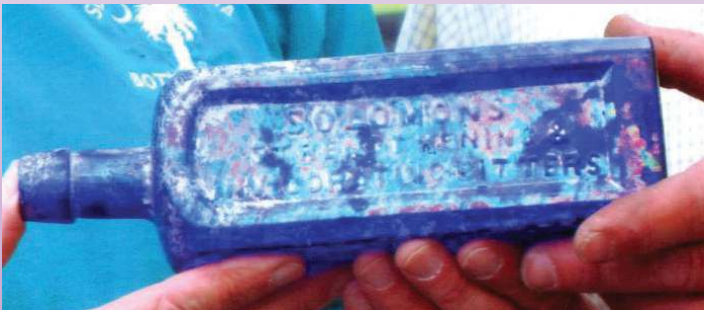
Vollmer plans to leave bitters bottle in its beautiful iridescence.