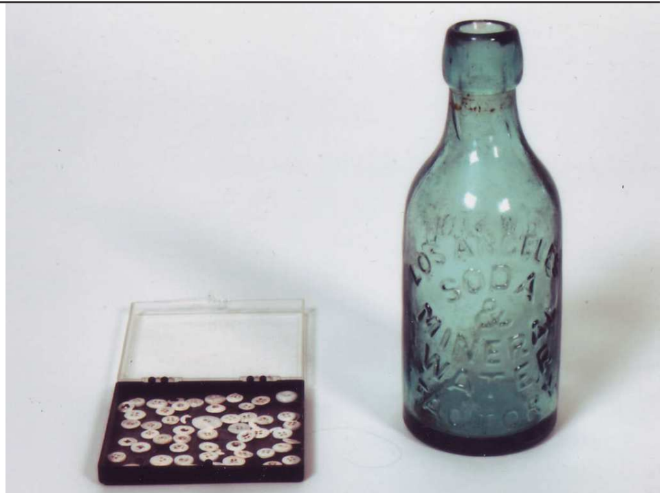
65 tiny baby button and the H.W Stoll soda bottle. (fig. 1)