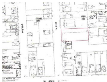
Sanborn 1906 Map. (fig. 3)