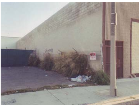
The lot on Main. (fig. 2)

Once they began clearing the vacant lot, I became very interested and checked out their progress daily. As time passed, I did some probing along a 50' arc behind the vacant small structure. No Luck. The lot being 70' X 150' meant there