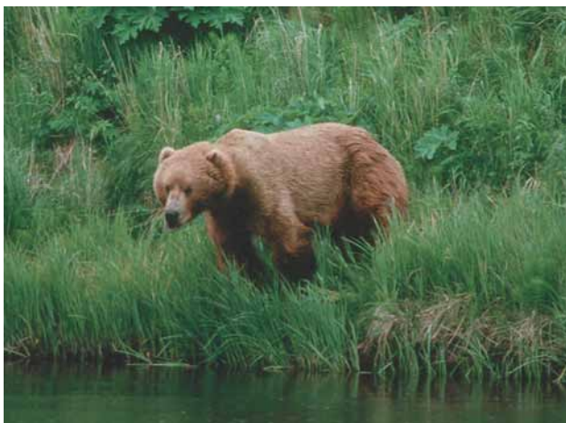
Brown bears are hazards for Alaska bottle collectors.

The money bottles have to be Alaska drug store bottles from 1890 to 1910, little clear medicines that are easy to find when we kick into virgin diggings. They sell in the $100 to $1,000 price range. There are at least 10 different