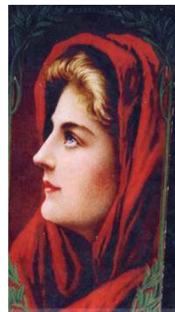
Hood's Sarsaparilla Booklet

Let's take a moment and look back to the 1800s. These colored Lithographs were drawn by the most talented artists of that time. Each young girl looks so real, closely resembling first class photography.