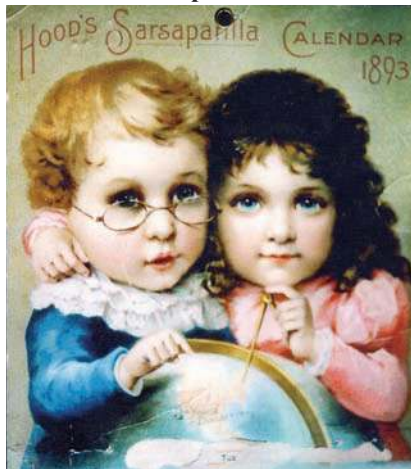
Hood's Sarsaparilla Calendar - 1893