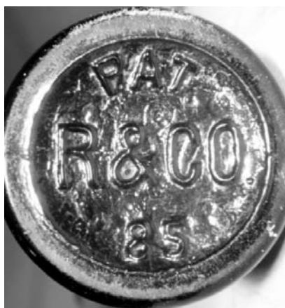
Figure 5 – R&Co mark with PAT 85 (eBay)

Toulouse (1971:341) noted that some “crudely made