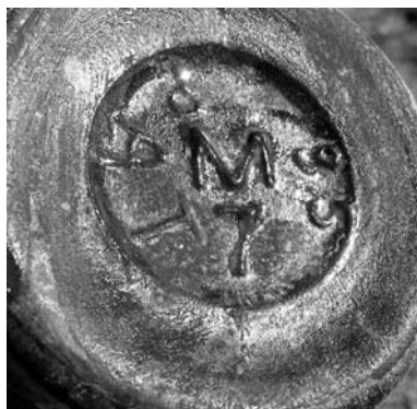
Figure 8 – M mark with PAT 85 (Fort Stanton)