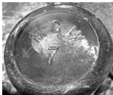
Figure 17 – Arched MGW mark – export beer bottle (Fort Bowie)