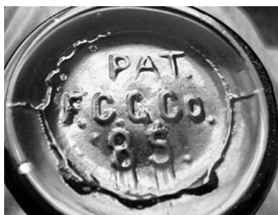
Figure 10 – FCGCo mark with PAT 85 (David Whitten)