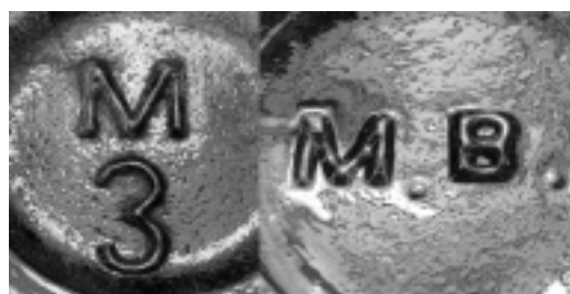
Figure 26 – Comparison of “M” logos

Historical context also requires a split category: temporal and product. Although these are somewhat intertwined, the context of time is the least complex. Bottles with the marks were found at six Southwestern military posts (so far): Fort Stanton (1860s-1896), Fort Bowie (1862-1894), Fort Union (1863-1891), Fort Custer (1877-1898), Fort Laramie (1849-1890), and Fort McKinney (1878-1894). Since Fort Laramie closed in 1890, the bottles were almost certainly made prior to that date. The most logical date for the change, however, is 1887, when the plant opened its second furnace. It is interesting that, with no idea of the maker of the mark, Lockhart (2009) recorded the probable date range at 1887-1891, based primarily on provenience at Fort Stanton.