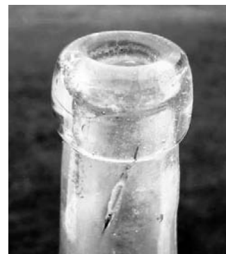
Figure 4 – Finish for Baltimore Loop Seal

same time – hence the sequencing (see below).