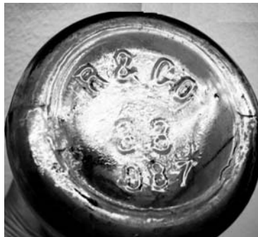
Figure 24 – R&Co in an arch – upper-case “O” in “CO” – two levels of numbers (Tucson Urban Renewal collection [TUR])