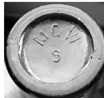
Figure 18 – Arched MGW mark – champagne beer bottle