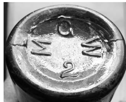
Figure 16 – Horizontal MGW basemark