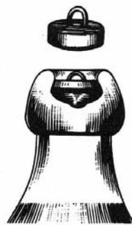
Figure 3 – Baltimore Loop Seal (Bill Lindsey)

Clearly, “PAT 85” could not appear on a bottle prior to 1885. It is highly likely that each company only used the mold to make the bottle until it wore out; the Baltimore Loop seal quickly came into common usage, alleviating the need to specify the patent number. Reed & Co. probably ordered six molds (with numbers 14-19) to be made for the “PAT 85” basemark at the