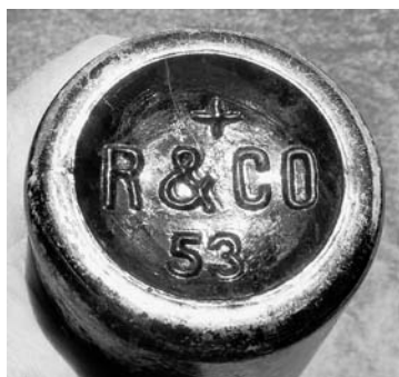
Figure 29 – Horizontal R&Co mark with plus sign (Bill Lockhart)

This mark is found in two slight variations. The first (possibly the oldest) had “R & Co” (note lower-case “o” in “Co”) in an arch with the letters spread out to almost the compass points – with the “R” just slightly above the “west” position. This variation always had a letter embossed in the “south” position, although our small sample only includes “C” or “D.”