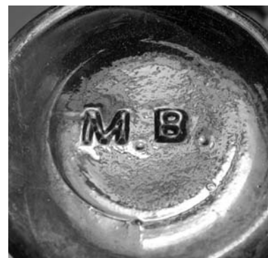
Figure 14 – MB basemark (NPSWACC)