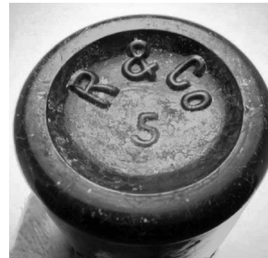
Figure 23 – R&Co in an arch – lower-case “o” in “Co”