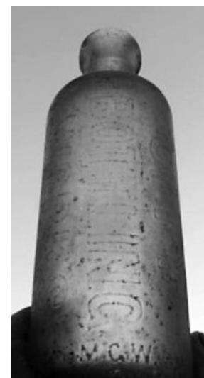
Figure 20 – MGW heelmark on Hutchinson bottle (eBay)

** M /-{number} (87); M {letter} (33); Other Ms (6). Wilson (1981:123) only showed three MGW marks and one M /-{number} at Fort Union and two MGW marks and one M {letter} mark at Fort Laramie (Wilson 1960).