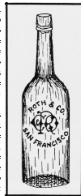
Figure 28 – Roth & Co. whiskey bottle (Thomas 1969)

The stamp was apparently created by the gaffer (blower), when he pressed the gob of glass at the end of his blowpipe onto the baseplate of the mold, then lifted it before blowing the glass into shape. We have not discovered any specific references to this technique in the literature nor any reason for its use – although it may have been a method to center the glass in the mold. However, the double stamp appears on some mouth-blown bottles between ca. 1894 and ca. 1914. It