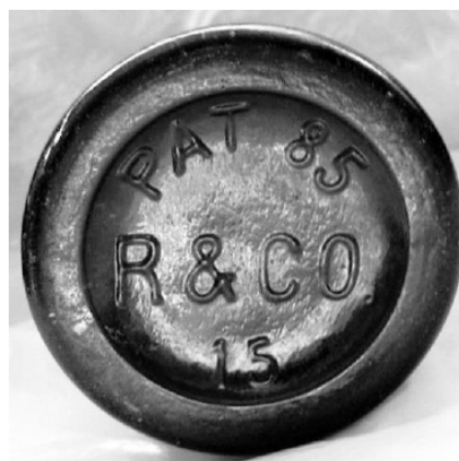
Figure 6 – R&Co variation with PAT 85