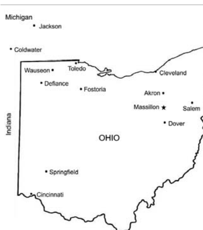
Figure 27 – Distribution of embossed bottles with MGW logos