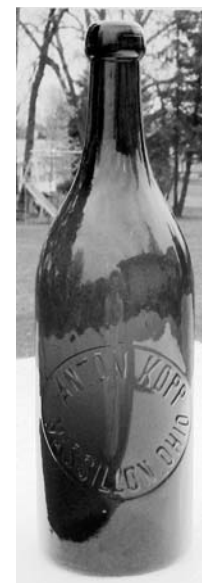
Figure 19 – Anton Kopp beer bottle – (Rob Riese)

Our examination of the bottles in the Tucson Urban Renewal collection (Arizona State Museum) in 2006 disclosed all three of the major variations in the sample of 26 bottles, along with sub-variations illustrated by the Ayers researchers (1980). However, manufacturing styles allowed us to create a probable