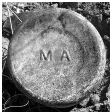
Figure 13 – MA basemark (Fort Stanton)