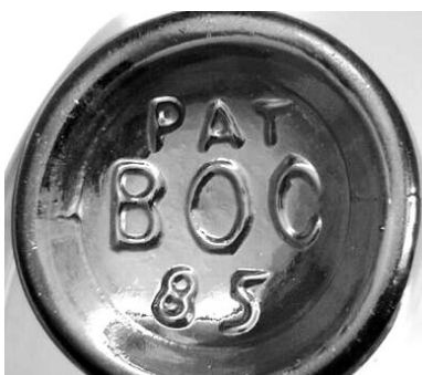
Figure 9 – BOC with PAT 85 – error for DOC (eBay)