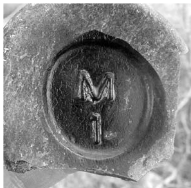
Figure 11 – M/1 basemark (Fort Bowie)

Two other types of bottles with the MGW mark have been reported. An emerald green pumpkinseed flask was marked on the base with the MGW logo (Antique Bottles 2004), but this is the only marked flask we have