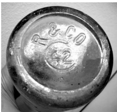
Figure 25 – R&Co in an arch – large serif “C” below (TUR)

Hopefully, future research will discover new historical sources that will confirm or deny the use of these marks by the Massillon Glass Works. A more likely avenue of research, however, is finding beer bottles with “M” marks in contexts that can be tightly dated to the 1881-1887 period.