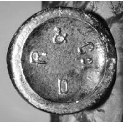
Figure 22 – R&Co and number equally spaced (eBay)