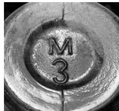
Figure 12 – M / 3 basemark (NPSWACC)