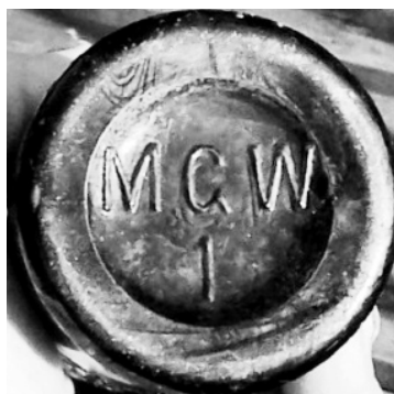
Figure 15 – Horizontal MGW basemark (eBay)