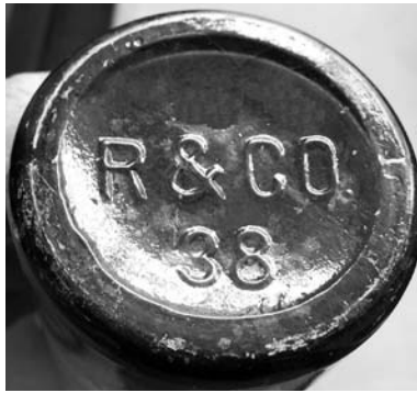
Figure 21 – Horizontal R&Co mark (Fort Laramie)

5. R&CO in an arch above a large serif “C” with a two-digit number in “C” (sometimes accompanied by a dot above the