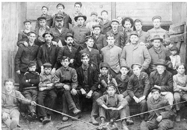
Figure 2 – Massillon glass workers, probably at Reed & Co.; note “No. 1” on wall at center of photo, kid holding an export beer bottle in upper center, and two kids with snap cases and beer bottles at lower center – also blowpipes and more beer bottles on ground in front

It was difficult to discover a chronology that fit all the aspects of manufacturing techniques, historical information, and data derived from the logos and numbers embossed on the actual bottles. A thorough search of the literature on fruit jars failed to disclose a single entry for either MGW or R&Co. It is virtually certain that the plant did not emboss its logo on any fruit jars. Also, see Table 1 for the chronology of the marks.