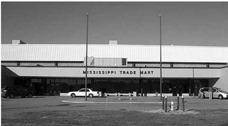
Exterior view of new Mississippi Trade Mart building.

Overhead view reveals wide aisles, full tables, and excellent crowds at this Mississippi January bottle and advertising show.