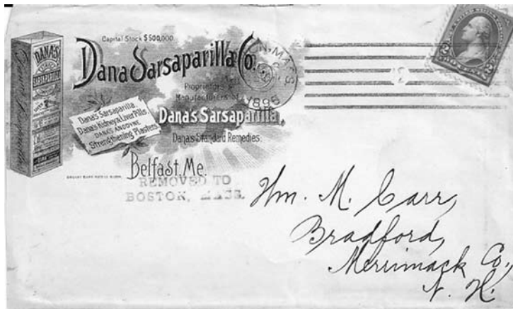
A Dana's Sarsaparilla business envelope, postmarked on both July 3 (obverse) and 4 (reverse), 1895.