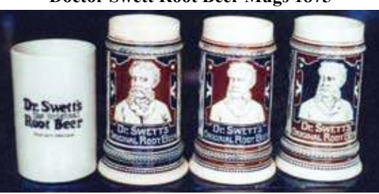
Doctor Swett Root Beer Stoneware Mugs