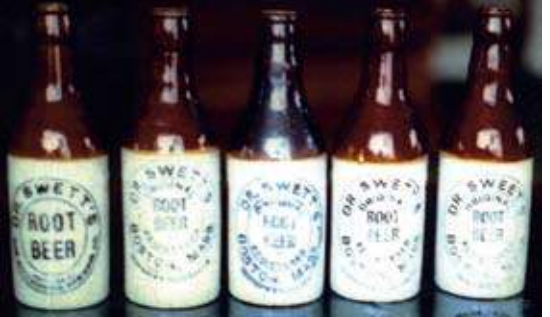
Doctor Swett Root Beer Stoneware Bottles

bottom space. Each mug would be made by pouring slip clay in the mold and it would be allowed to dry for two days. The handle would be glued on with the clay slip and it would dry for another day. Each mug would be finished by the painters. Most of the mugs were painted in a cobalt blue, deep green, or chocolate Albany slip. After painting, each mug would be fired in the kiln for seven days. The bottom of each mug is stamped with a mold number, a potters stamp, and a fine check mark, indicating that it has been inspected.