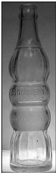
Left: Woosies (embossed, clear glass) Woosies / Beverages / RJC (on the bottom, "Real Juice Co. / Cap. 10 Fl. Oz. / 242-1-B / LG 53 / Dallas, Texas Right: Sonny Boy in clear glass.