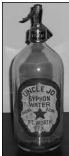
Left: Joys (white ACL, clear glass) Joys Beverages / Conts. 7 Fl. Oz. Hires Bottling Company Alexandria & Lake Charles LA., with five-pointed stars and bubbles (On the bottom, "33-B-7 / 2") Right: Uncle Jo Syphon Water (white/blue ACL, clear glass) Uncle Jo / Syphon Water / Phone 2-2391 / Ft. Worth Tex. / Cont. 36 Fl. Oz. with a six-pointed star around the nozzle

Syphon bottles also exist in blue, green, and amber.