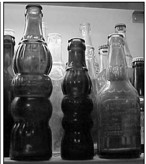
Uncle Jo and Aunt Ida bottles.