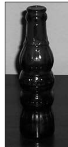
Uncle Jo (embossed, amber glass) Uncle Jo in Brown Bottles Contents 4 Fl. Ozs. / Reg U.S. Pat. / Ofc. (On the bottom, "Pat. 30009 / Pat'd Apr 2, 1929" with six-pointed star.)