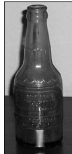
Aunt Ida (embossed, green glass) "Aunt Ida The World's Greatest Mixer" Shreveport, LA (with six-pointed star) "Aunt Ida The Favored Drink" (On the bottom, "Duncan, OK" with six-pointed star.)

There are several examples in this "family" of bottles in my collection. The embossed amber Uncle Jo above was also the same as the green one used for Aunt Ida (below). The 4-ounce Uncle Jo "mini" was a smaller version of a larger amber example easier to find than some of the other "family" members. It is also the shape found as "Sonny Boy," but in clear glass.