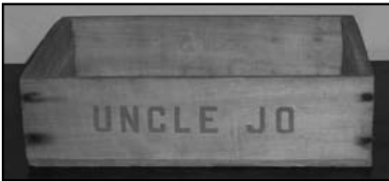
Wooden crates were made to hold both the regular-sized bottles and the minis (below).

In addition to bottling soda, the Uncle Jo Bottling Company sold their original flavor extracts in Texas, Arkansas, Louisiana and Oklahoma and had a few franchises. The Fort Worth and Shreveport operations were the strongest and survived into the