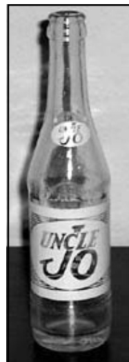
Left: Uncle Jo (embossed, amber glass) Uncle Jo in Brown Bottles Trademark Registered 22016 Contents 8 Fl Ozs. Fort Worth Texas