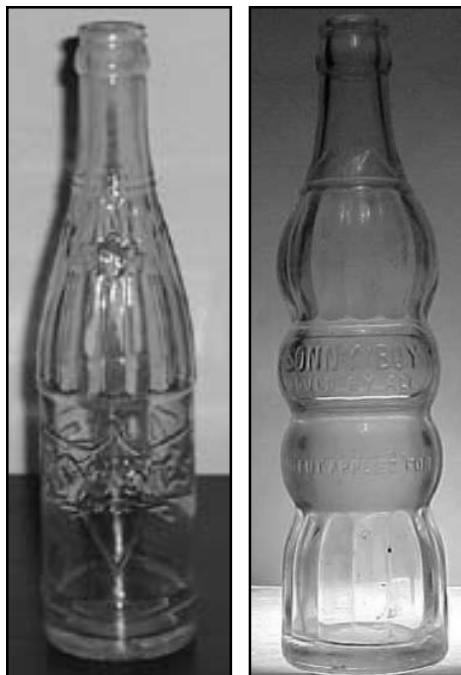
Left: Woosies (embossed, clear glass) Woosies / Beverages / RJC (on the bottom, "Real Juice Co. / Cap. 10 Fl. Oz. / 242-1-B / LG 53 / Dallas, Texas Right: Sonny Boy in clear glass.