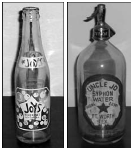
Left: Joys (white ACL, clear glass) Joys Beverages / Conts. 7 Fl. Oz. Hires Bottling Company Alexandria & Lake Charles LA., with five-pointed stars and bubbles (On the bottom, "33-B-7 / 2") Right: Uncle Jo Syphon Water (white/blue ACL, clear glass) Uncle Jo / Syphon Water / Phone 2-2391 / Ft. Worth Tex. / Cont. 36 Fl. Oz. with a six-pointed star around the nozzle

Syphon bottles also exist in blue, green, and amber.