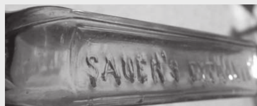
Figure 13 – Slanted side panels