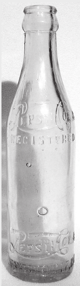
Figure 5 – Pepsi-Cola base with A.G.W. logo

The fort was occupied from December 1880 to May 1888 (with a small detachment remaining until 1890), indicating that the flask was probably made during that period. Wilson and Caperton did not mention any post-military occupation of the fort until the 1940s. This somewhat cryptic notation may question the use of the Circle-A logo by American Glass (see Discussion and Conclusions). AGW (1908-1935)