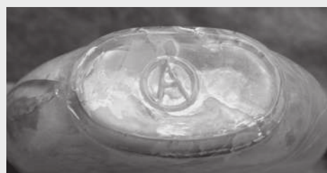
Figure 1 – Circle-A on the base of a pumpkinseed flask

We also observed and photographed a colorless medicinal bottle at the University of Wyoming (Laramie), embossed on the base with a Circle-A logo (Figure 2). Note especially the apparent rough place at the joint of the heel and the base, just below the Circle-A logo in the photo. The bottle was mouth blown with a crude, one-part finish. Finish, neck and overall appearance are very similar to the Sauer's Extract bottle discussed in the Medicine Bottle