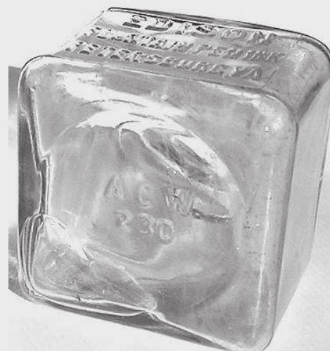
Figure 27 – Base of Edison Ink bottle

One eBay auction featured a colorless ink bottle embossed “ACW / 230” on the base and “EDISON / FOUNTAIN PEN INK / PETERSBURG, VA.” on the side (Figure 26). Although the base logo used a “C” instead of a “G,” the Virginia location of the company, coupled with the typical mark/code configuration, suggests that the basemark was an engraver's error (Figure 27). The second bottle was a colorless Warranted Flask embossed “AGW / 158” in a double-stamped