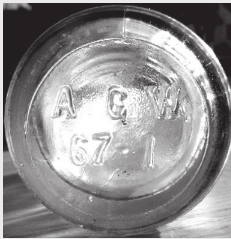
Figure 8 – Example of a Richmond machine-made soda bottle base

Mouth-blown bottles were made from the inception of the company in 1908 to at least 1916, although probably not long after that. The general transition from mouth to machine, at glass houses that specialized in soda bottles, took place between ca. 1913 and ca. 1920, with most using machines by ca. 1916 or earlier. The first listing we have for machine manufacture is 1916, although it could have occurred slightly earlier. Soda bottle production almost certainly ceased in 1929, and listings as early as 1927 were only for “flint” bottles. Although some soda bottles were made again from 1933 to ca. 1935, these, too, were colorless. Dr. Hostetter’s Stomach Bitters