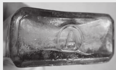
Figure 2 – Circle-A on a medicinal base (University of Wyoming collection)