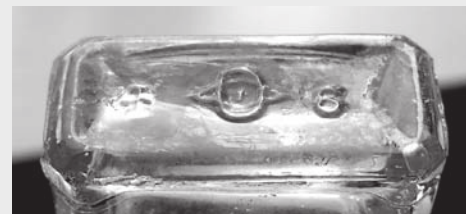
Figure 23 – Base of 1926 Owens-Illinois bottle for Sauer's

the shoulder and finish. All four faces had sunken panels,[3] and the two side panels were still slanted – although the “SAUER'S EXTRACTS” embossing was much higher in quality. The bottles were still topped with the tooled “packer” finish, although the lower edge was now rounded. Two bottles in our sample had slightly slanted necks – a product of continued hand manufacture in two-leaf molds.