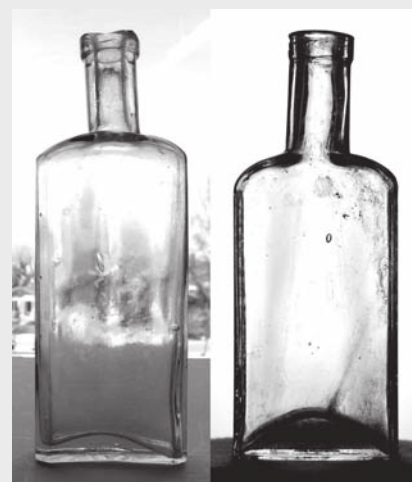
Figure 16 – Comparison of Type I Circle-A bottle (left) and Type II A.G.W. bottle (right)