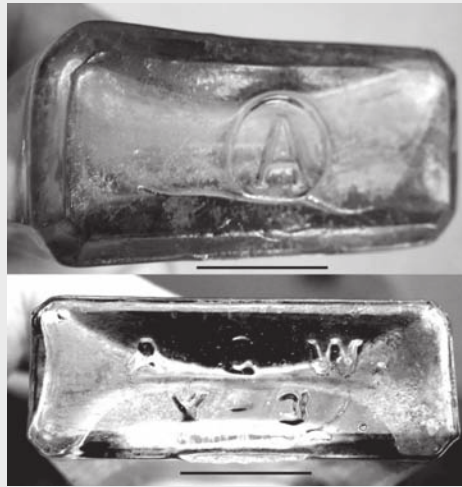
Figure 28 – Comparison of fins on bases

According to Russ Hoenig, the fins on rectangular bottles at the base-heel junction stem from the hinge pins or mold arms. A loose or worn pin, for example, can cause one mold half to ride up over the edge of the baseplate. This friction, of course, wears away the metal over time, creating the conditions described above. Repairs