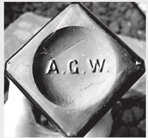
Figure 9 – Hostetter’s base with AGW logo

Many AGW Hostetter’s bottles have double-stamped logos. This phenomenon is associated with the period between ca. 1895 and ca. 1915. Although some photos were unclear, all bottles appeared to have tooled finishes. Richard Siri (personal communication 2/13/2010) stated that all Hostettters with AGW mark had tooled finishes,