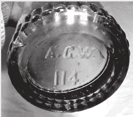
Figure 7 – Example of a Richmond-made, mouth-blown soda bottle base (eBay)

American Glass apparently used a numerical code system similar to the one used by D.O. Cunningham (see Cunningham family glass companies section) and some other soda bottle makers. In all cases we have discovered, each mouth-blown container had two- or three-digit numbers embossed below the A.G.W. logo (e.g., A.G.W. / 133). Some of these had double-stamped bases (Figure 7). A single example (a Pepsi-Cola bottle used in Newport News, Virginia) had no accompanying number. Another mouth-blown example (amber, used by a bottler in Pittsburgh) had an A.G.W. heelmark. Machine-made bottles were embossed with a one- or two-digit number, a dash, then a single-digit number, beneath the mark (e.g., AGW / 67-5 – Figure 8).