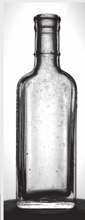
Figure 24 – Body of 1927 bottle, showing finish