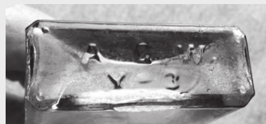
Figure 15 – A.G.W. / Y-3 on Sauer's Extract base