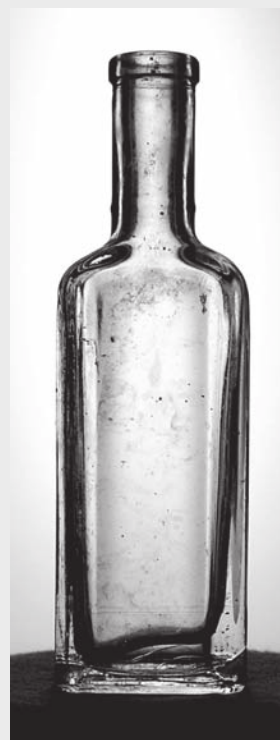
Figure 22 – Body of 1926 bottle, showing finish