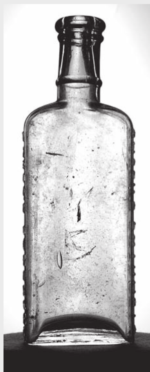
Figure 19 – Type IV A.G.W. bottle