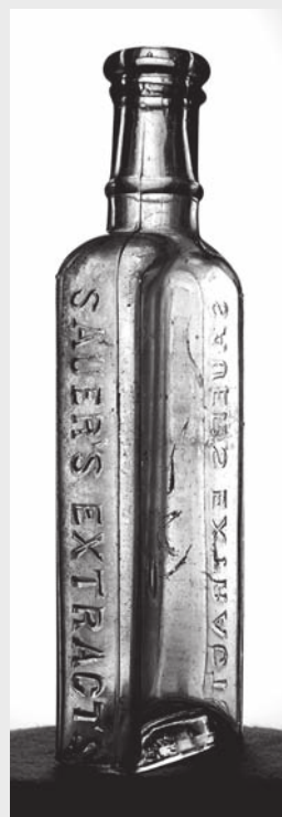
Figure 20 – SAUER'S EXTRACT – side panel (not sunken)