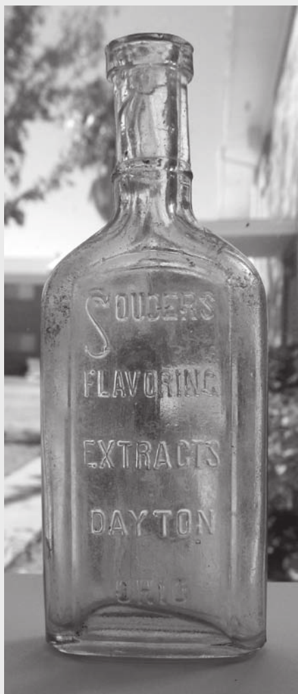
Figure 25 – Souder's Flavoring Extracts – a Sauer's spinoff [10-28 Fourth Shoot]

finish. The base is embossed “2 <0> 7 5 (with the “5” sideways)” – and the “7” (1937) again appears to have been drilled and redone.