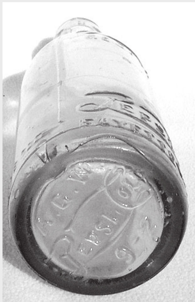
Figure 6 – Pepsi-Cola bottle with A.G.W. basemark (eBay)