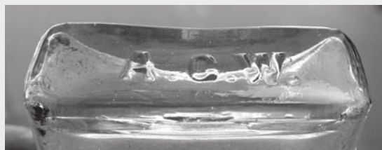
Figure 21 – Base of later Sauer's bottle – A.G.W.