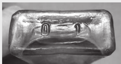
Figure 18 – Sauer's ball-neck panel base without the fin