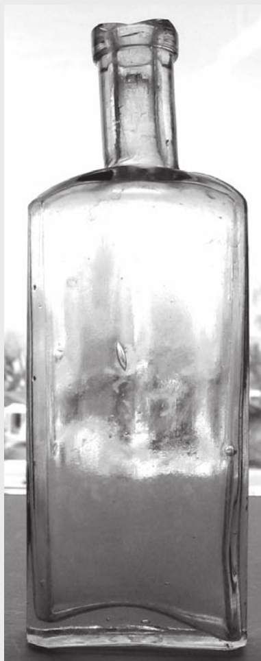
Figure 3 – Medicine bottle (Circle-A)