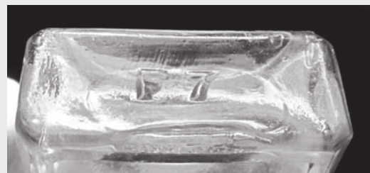
Figure 12 – Faint oval on base