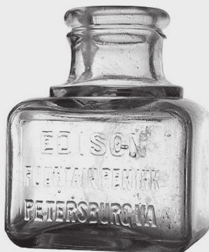
Figure 26 – Edison Ink bottle (eBay)

As with many other successful products, Sauer had at least one imitator. The bottle was colorless, oval in cross-section, and mouth-blown into a two-leaf mold. It had a ball neck with a flattened panel on the back side and a sunken panel on the front. The front panel was embossed “SOUDERS / FLAVORING / EXTRACTS / DAYTON / OHIO” (Figure 25). At least one eBay seller did not read the label well and sold imitation bottles as being from Sauer. Other Bottles