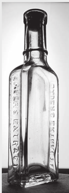
Figure 17 – Sauer's ball-neck panel bottle (Type III)