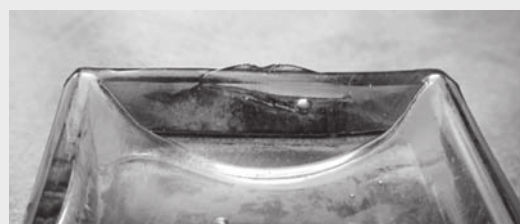
Figure 11 – Fin at the intersection of the base and heel

Type III was actually a major change in style – to ball-neck panel bottles (Figure 17). The "ball" was an embossed ring around the neck set about a quarter of the way up between