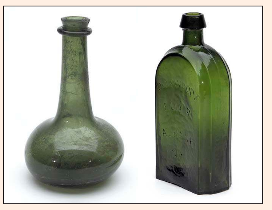
Above: Rare and early Shaft and Globe Bottle realized $5,850 and Extremely rare Dr. J.S. Woods Medicine Bottle realized $11,700 Below: Extremely rare sized P & U. S. Spring Co Mineral Water Bottle $4,680

Lot 18, a GII-9 Eagle - Eagle With Snake In Beak Historical Flask an early Pittsburgh district flask, in light apple green also was new to the market. This flask was a fine example, with an unusual color for this mold and also strongly embossed. The bottle, nicknamed the "Snake of Corruption", because of the obverse motif of a snake or serpent being held in the beak of an eagle, has always been one of the most popular of the historical flasks. A recent "fresh" find at an estate sale outside of Columbus, Ohio, it was rushed to Hecklers to make it available for the sale. The consignor stated that he had purchased bottles in the past at estate sales and held his hand up a little longer for this one because he sensed it was possibly better than the other items in the box lot offerings! The "Snake" had a pre -auction estimate of $6,000 - $12,000 and achevied a hammer price of $10,530.