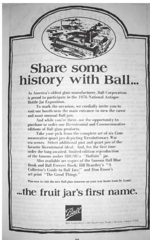
1976 Ball Corporation Advertisement

If my memory is correct, the boxes of display and sales jars which