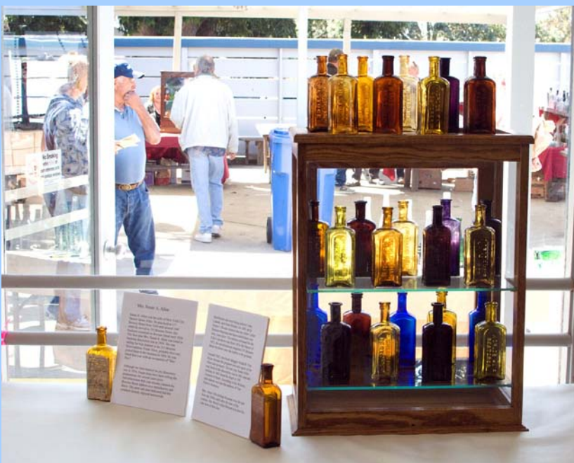
Beautiful window displays