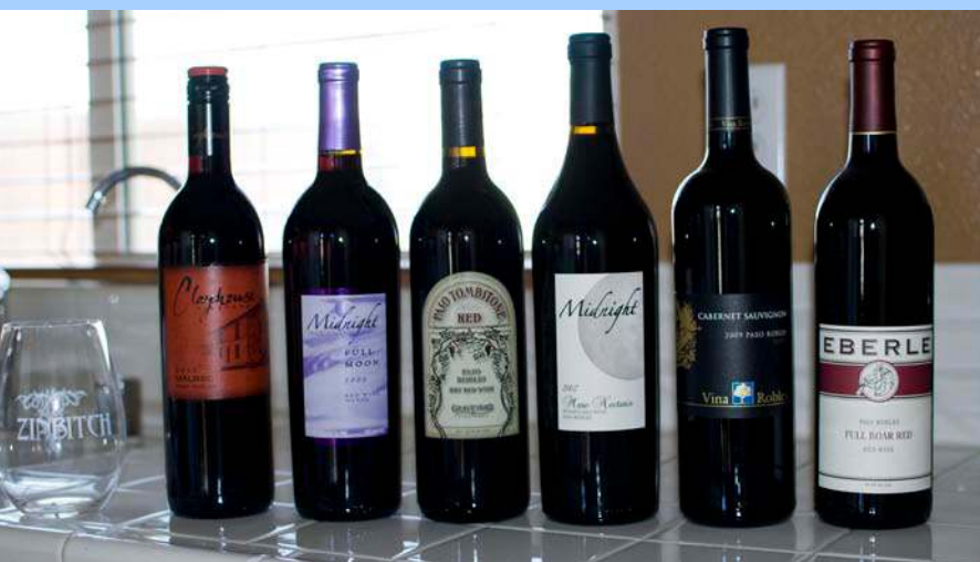
Paso Robles, which I enjoyed just the same.