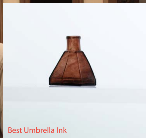
Best Umbrella Ink