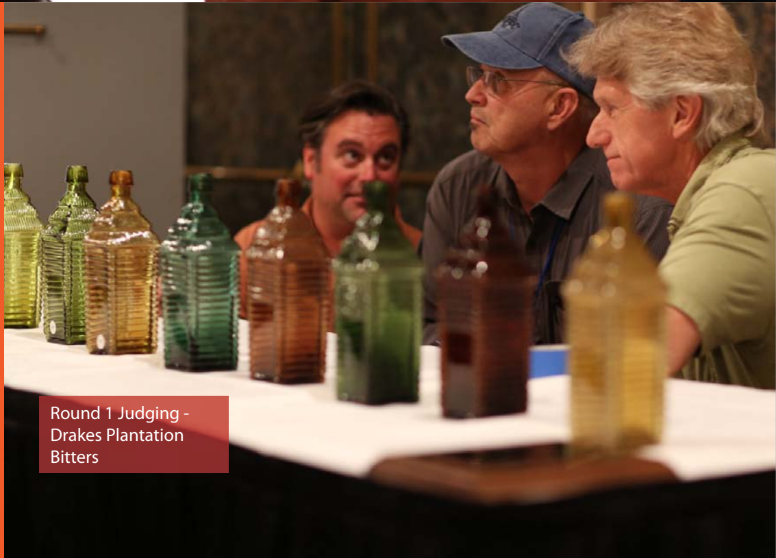
Round 1 Judging - Drakes Plantation Bitters