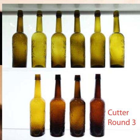
Cutter Round 3