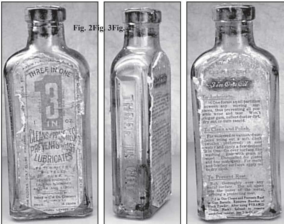
Fig. 2 Fig. 3 Fig. 4