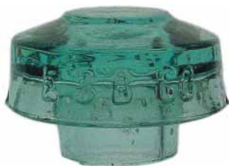
Figure 10: CD-20 E.S.B. Co.