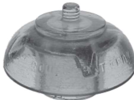
Figure 5: Gould Battery (R) Patented Dec. 1, 1896, aqua