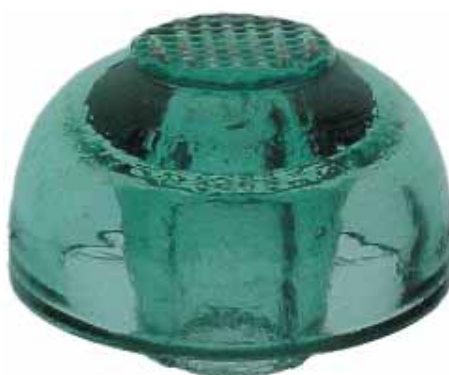
Figure 11: CD-24 embossed The United States Light & Heating Company, aqua