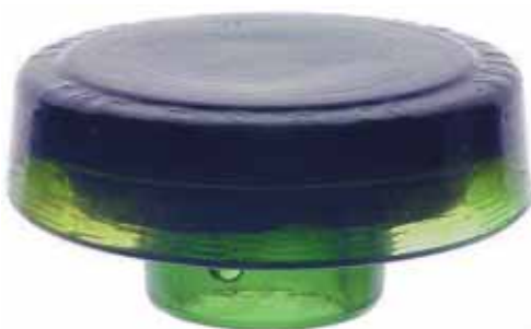
Figure 7b: Chloride Accumulator / The E.S.B. Co., battery rest, green.