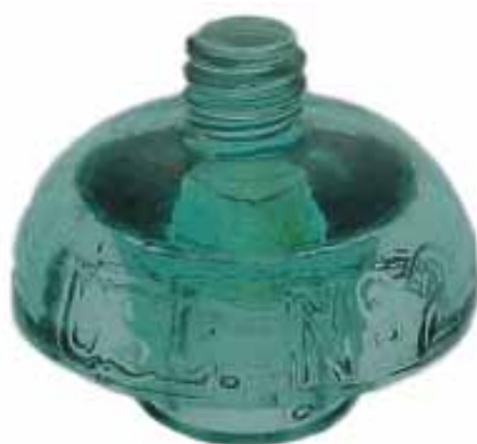
Figure 4: USL No 2, light aqua