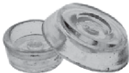
Figure 8 British battery insulators are in two parts.

a year ago, the only colors known to exist in the in the two-part battery insulators were light green and light aqua. Illustrated [Figure 8] is a clear base battery insulator that is believed to be the only one known at this writing.