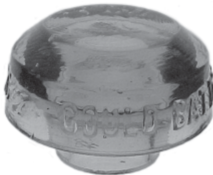
Figure 14: Another CD-22.5, this one light lavender in color.

Figures 5 and 6 illustrate two Gould insulators. Figure 13 is a beautiful example of a yellow-green CD-22.5 patented Dec. 1, 1896 while Figure 14 features another CD-22.5 in light lavender.