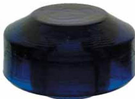
Figure 15: A CD-22 with no embossing in deep violet cobalt blue.