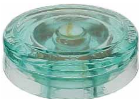
Figure 7a: Chloride Accumulator / The E.S.B. Co., aqua