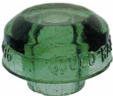
Figure 13: CD-22.5 embossed: (F) Gould Battery (R) Pat. Dec.1.1896, yellow-green