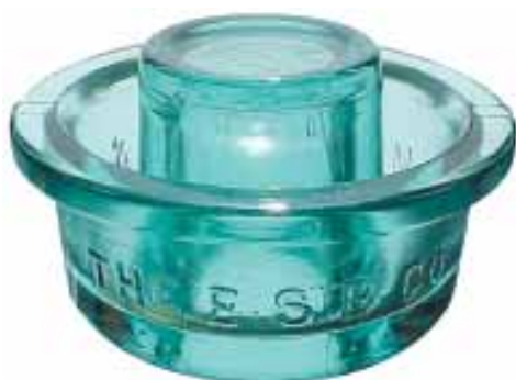
Figure 2: "Birdfeeder" battery insulator.