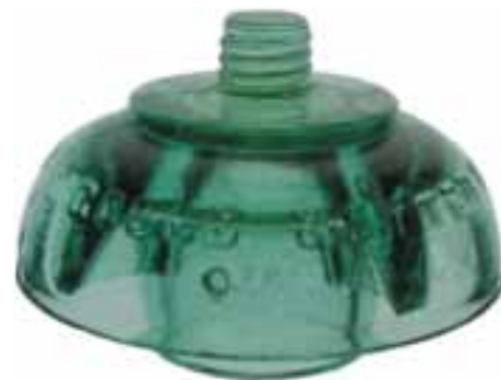
Figure 6: Gould Battery (R) Patented Dec. 1. 1896, light green