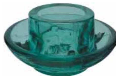
Figure 9: CD-29 no embossing, light-green