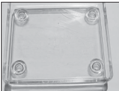
Figure 3: Glass tray.

However, this did not prevent the decay of the wooden stringers, so the Electric Storage Battery Company (E.S.B. Co.) designed and developed the combination of an oil insulator and an earthenware pedestal that solved the problem of the wood decaying. This earthenware pedestal / oil insulator became the standard for the industry and made it possible to finally do away with the wooden stringers.