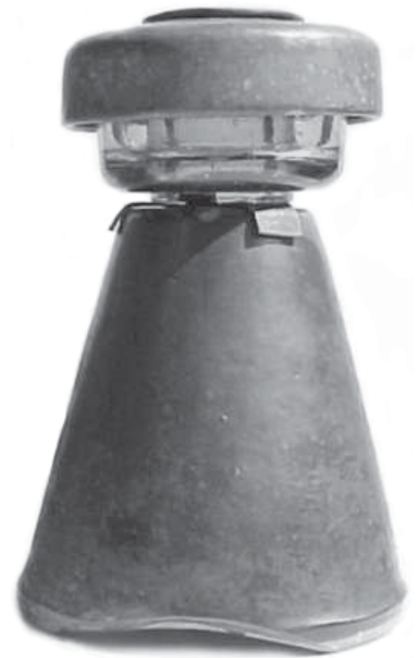
Figure 1: Pedestal oil insulator.

on separate glass trays [Figure 3] or boxes filled with sand. This was necessary due to the absense of a sealed cover which allowed acid-laden moisture to run down the outside of the jar and attack the wooden support (susceptible to rot) that the battery sat on.