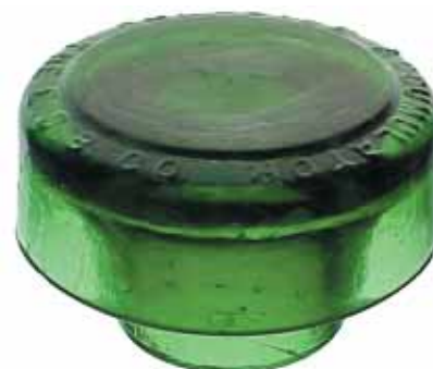
Figure 12: CD-30 embossed Chloride Accumulator / The E.S.B. Co., emerald green