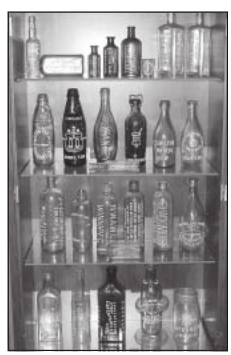
Canadian bottle display.