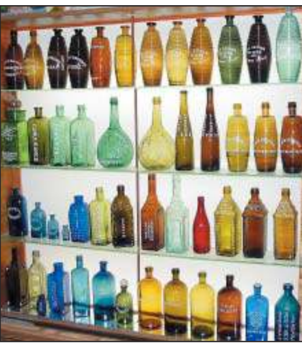
Left: J. Boardman soda in pink. Right: Another display case of bottles.