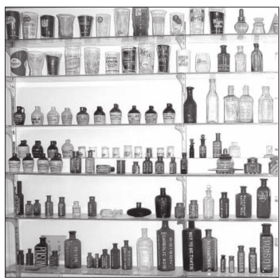
Assorted colors, shapes and sizes of bottles cover the east wall.

"(5) HARRISON-TIPPECANOE early pontilled ink in any color."