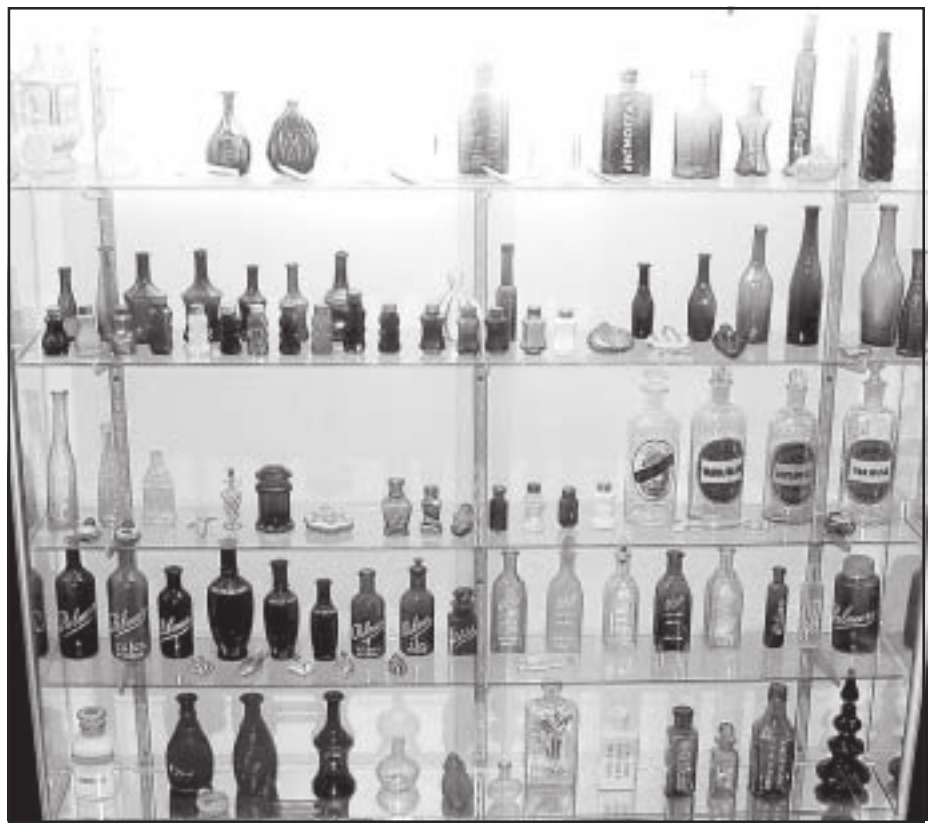
Another display, this one is toiletries.

"(5) HARRISON-TIPPECANOE early pontilled ink in any color."