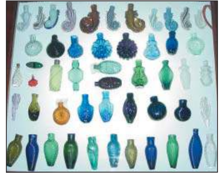
Small scent bottles.