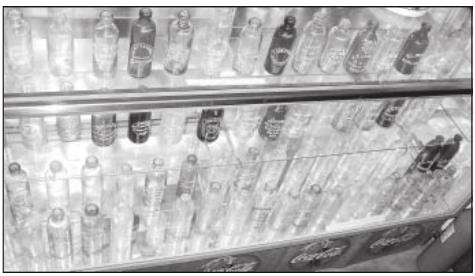
A view of the fifty-state collection of Hutchison soda bottles.