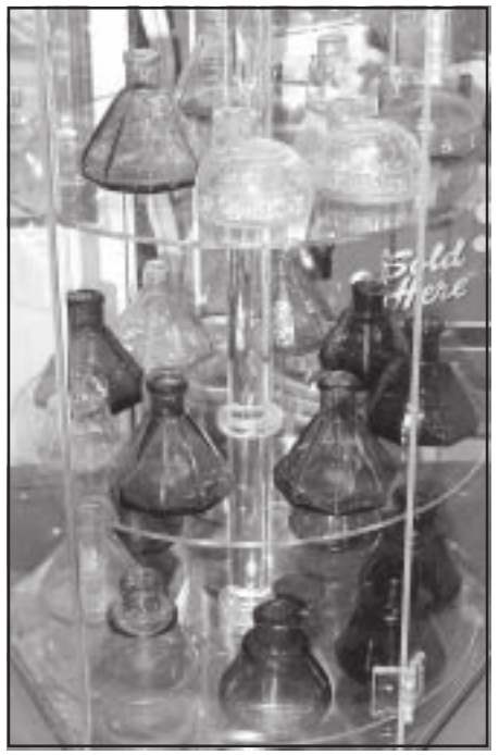
Rotating display of ink bottles.

Bryan's principles and classy attitude are what helped form my bottle collecting hobby and hopefully yours too. Bryan truly is a special person with an unbelievable collection. See the pictures included with this article and you be the judge of what I know is The Best Bottle Collection in the WEST!!!