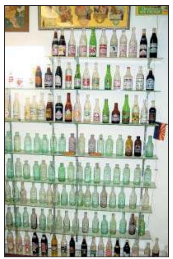
Above and below: Sodas.