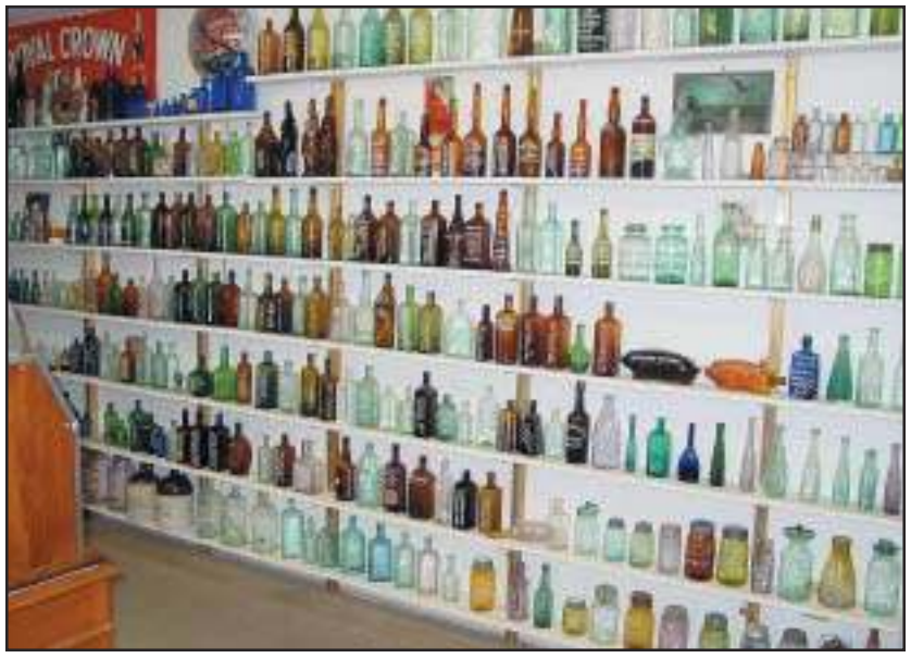
Another wall of bottles.