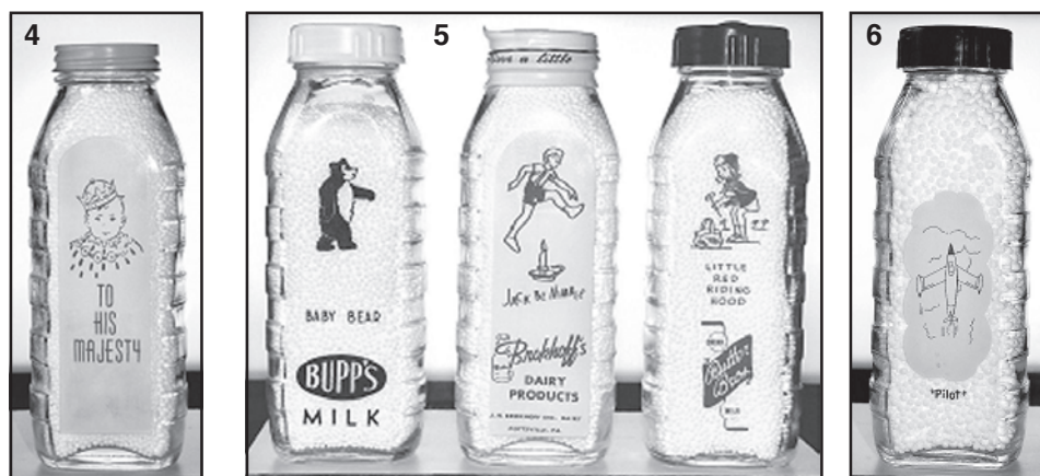
Figure 4: One of the Bank Bottles. This one is printed in blue on a white panel for the boy child. The girl version was a queen girl printed in red on a white panel. Both styles are also found without the white panel. The blue slotted top for the boy and the pink slotted top for girls were held tight by a band of heat shrink tape.