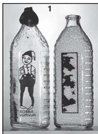
Figure 1: Two of the original Knox Glass Company set of Nursery Rhyme Baby Bottles. Note the small neck for the pull-on nipples, the line-ribbed sides and the icicle type design on the shoulder area. The Scotty Dog design (right) was not carried into the Callet set of Nursing Rhyme bottles.