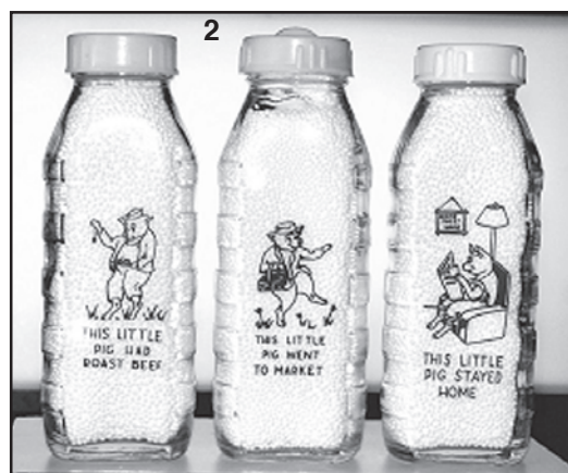
Figure 2: The Three Little Pigs set of the wide mouthed Nursery Rhyme bottles. The most common color of the pyroglazing is dark green, but they have also been seen in orange, yellow and black. These examples have the Evenflo plastic collars, not the Callet collars, mounted on the bottles. If you look carefully, you can also see the different sizes of lettering and that on the first bottle the design is slightly cockeyed.